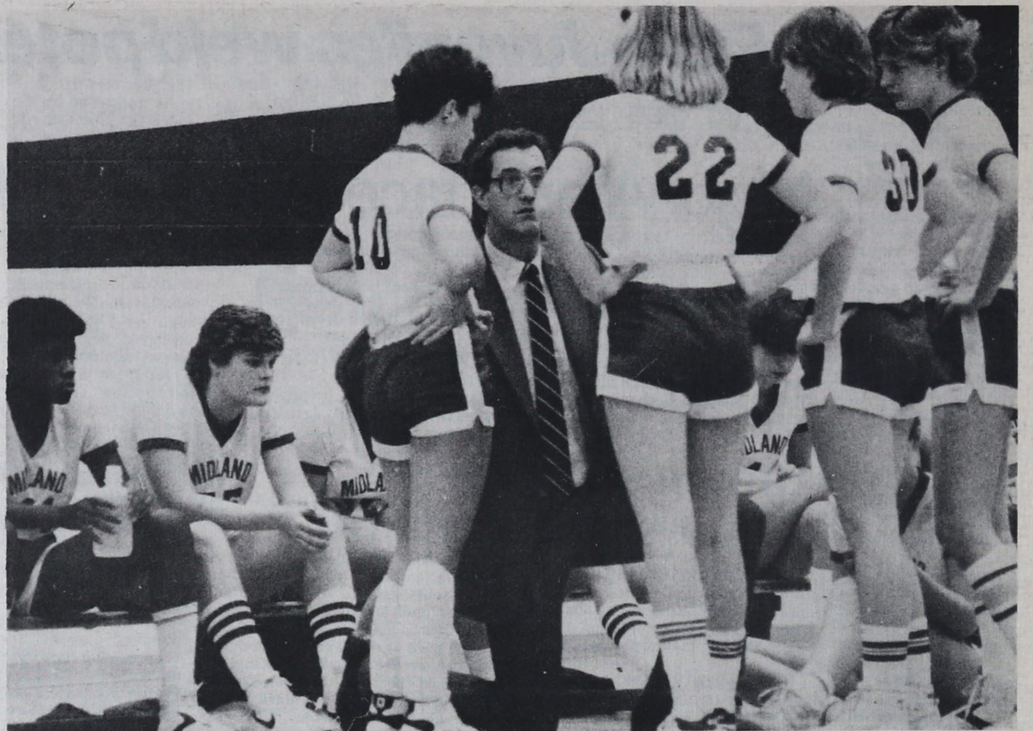
'Okay girls let's win it for MSS'

Midgets travel to Barrie on Friday for an exhibition game and will be in Elmvale on Sunday.