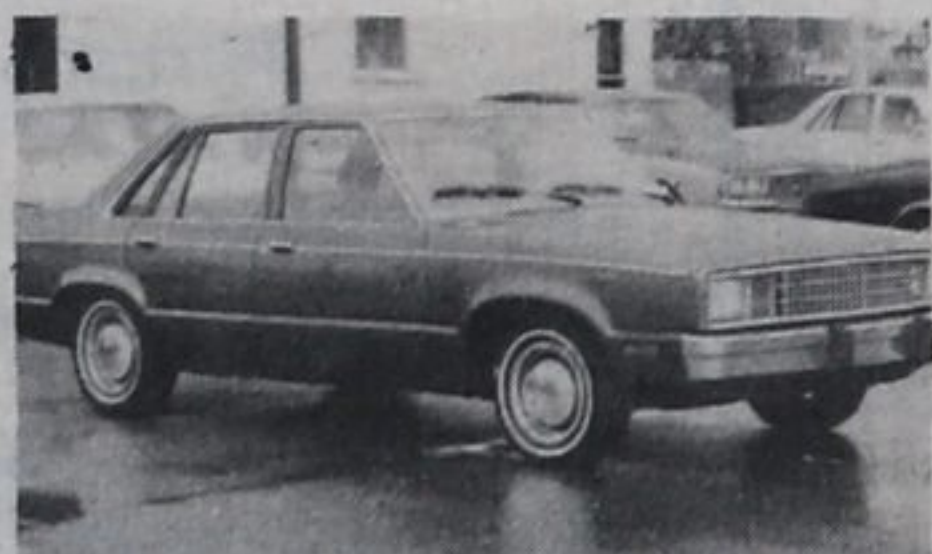
1981 FAIRMOUNT 4 dr., 4 cyl., auto., p.s., p.b., radio, 89,000 k, Excellent economical car!