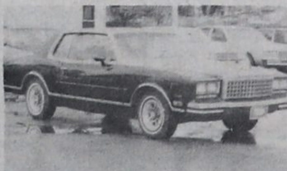
1980 MONTE CARLO Sm V8, auto., p.s., p.b., bucket seats, radio, two tone blue, 63,000 k, Excellent condition!