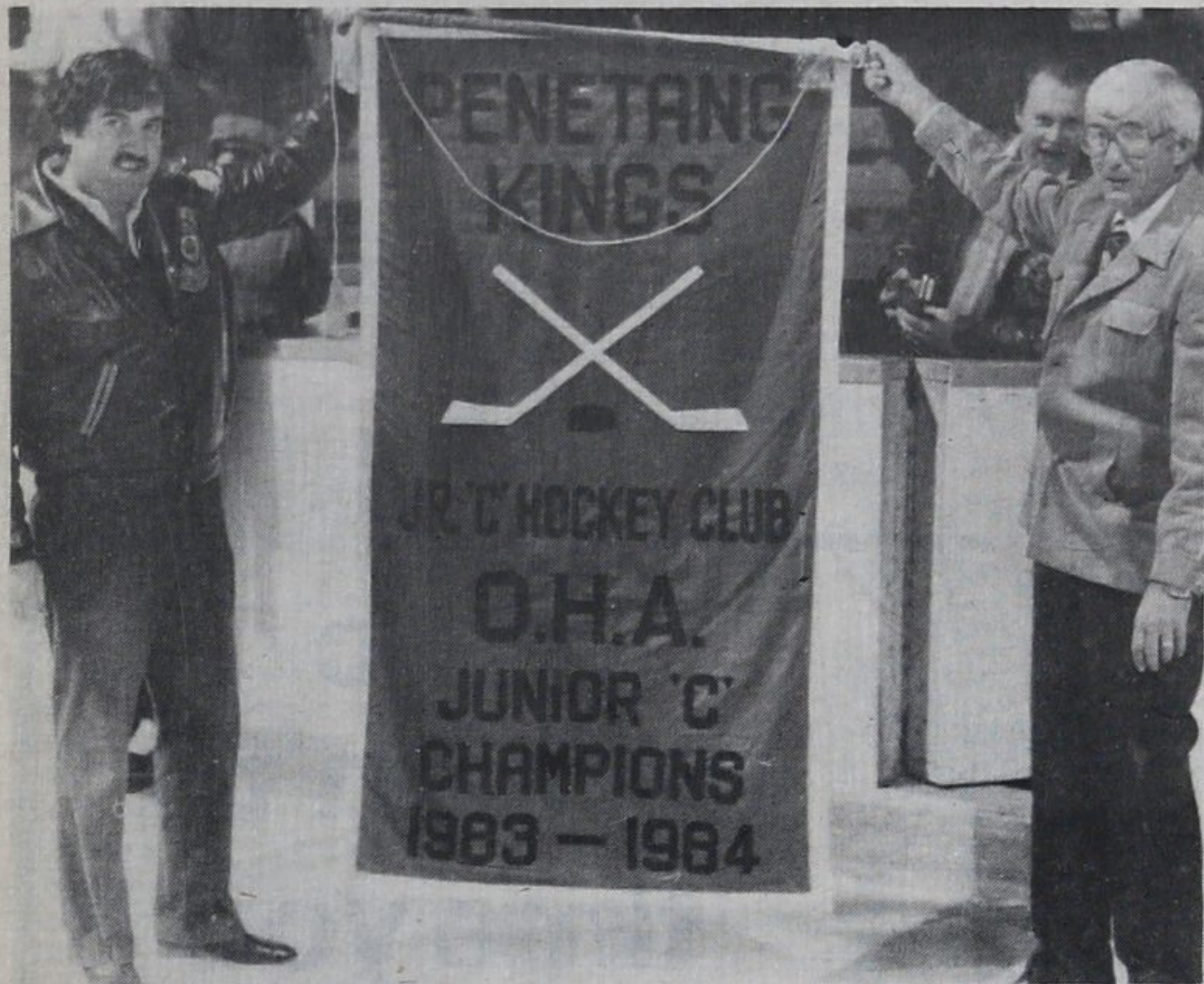
Proud moment for King's owner!