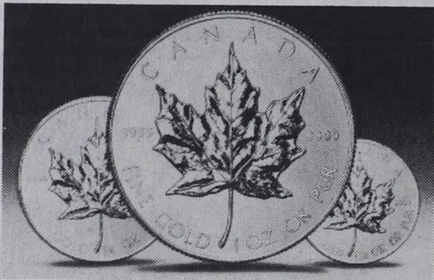
THE CANADIAN MAPLE LEAF , the world's purest gold coin, is now available in three sizes — one ounce, 1/4 ounce and 1/10 ounce. †

The world's purest gold coin minted today is the Canadian Maple Leaf, struck by the Royal Canadian Mint. It is the only 9999 fine, 24-karat coin available and is struck from gold minted exclu-