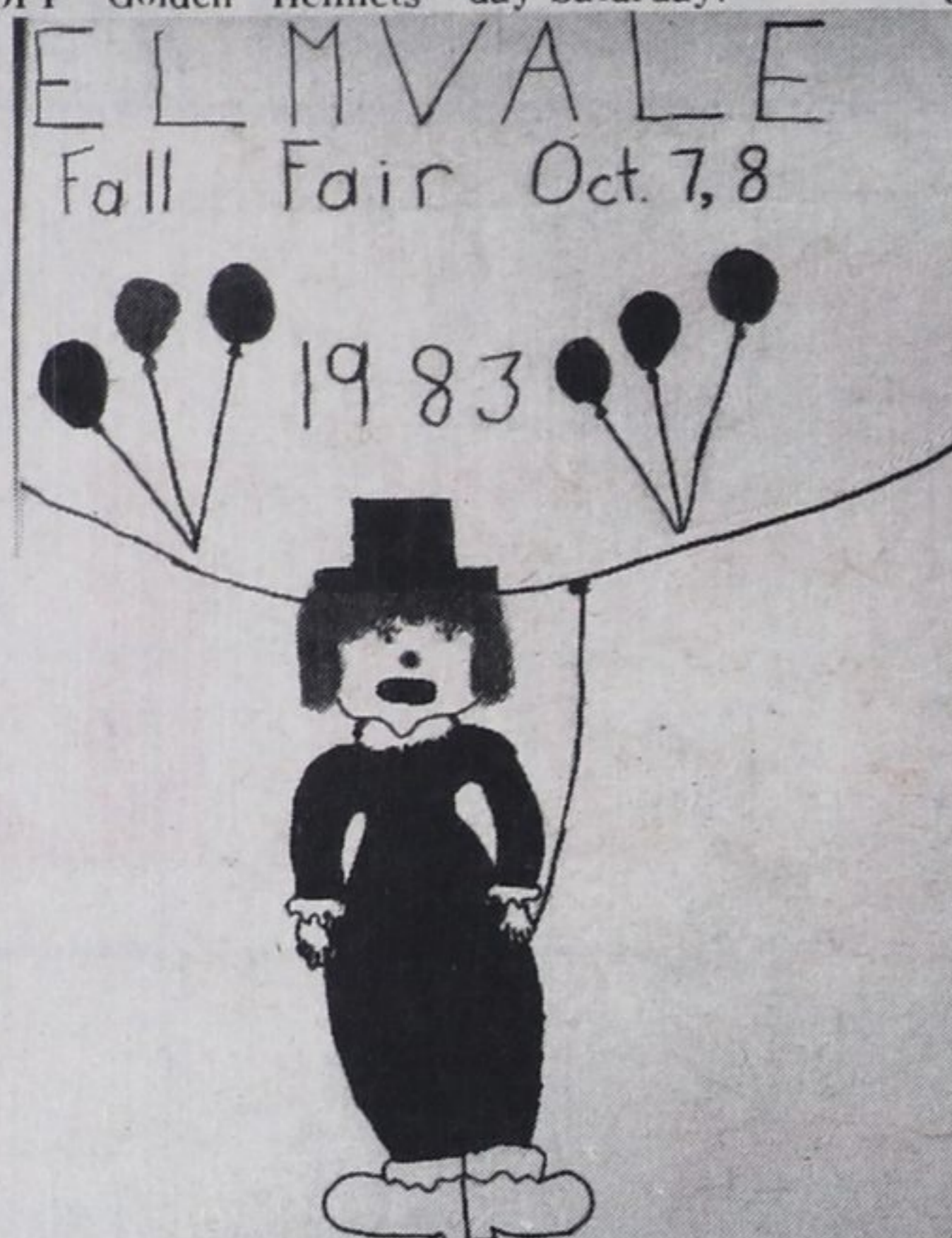
Elmvale Fall Fair

the Arena, will begin at 9 p.m. at the Arena. Northern Edition will provide the music.