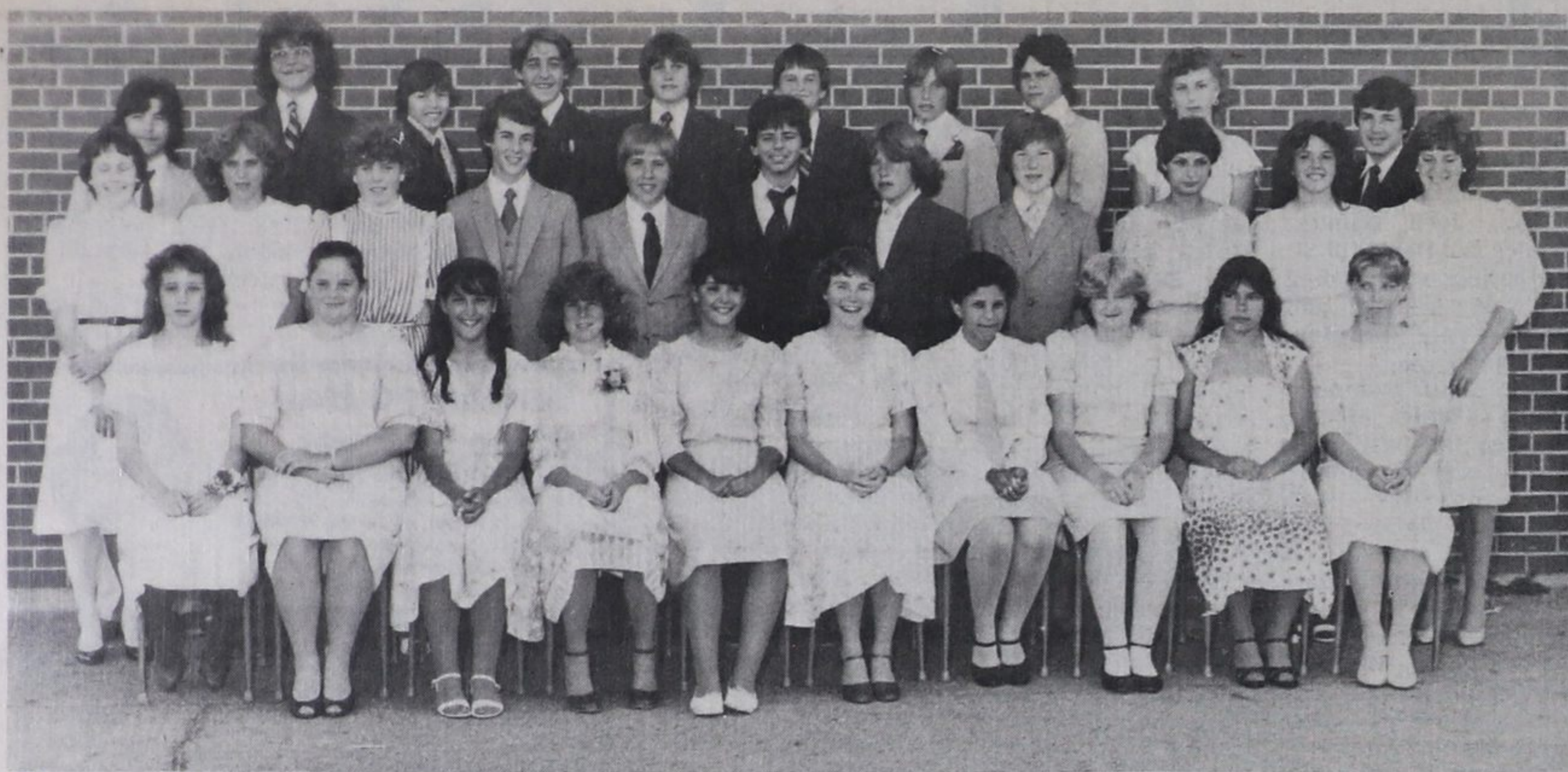
Grade 8 grads at Sacred Heart School commencement