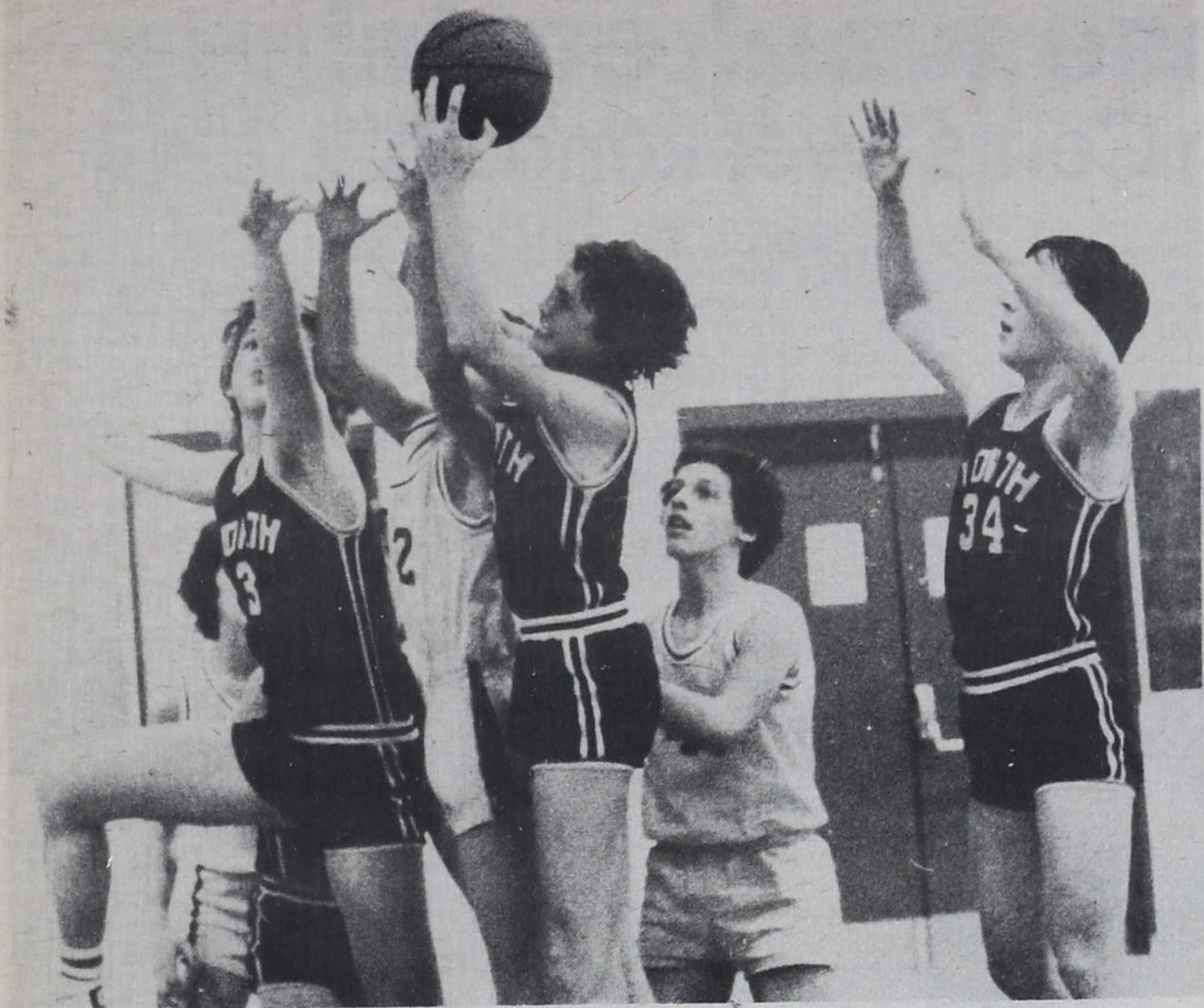
Gimme that ball! Barrie North player hauls down rebound in midget tourney action with MSS

This allowed the local boys with a win, a tie, and a loss to advance to the semi-finals to be played on Monday Dec. 20. As we went to press no results were available.