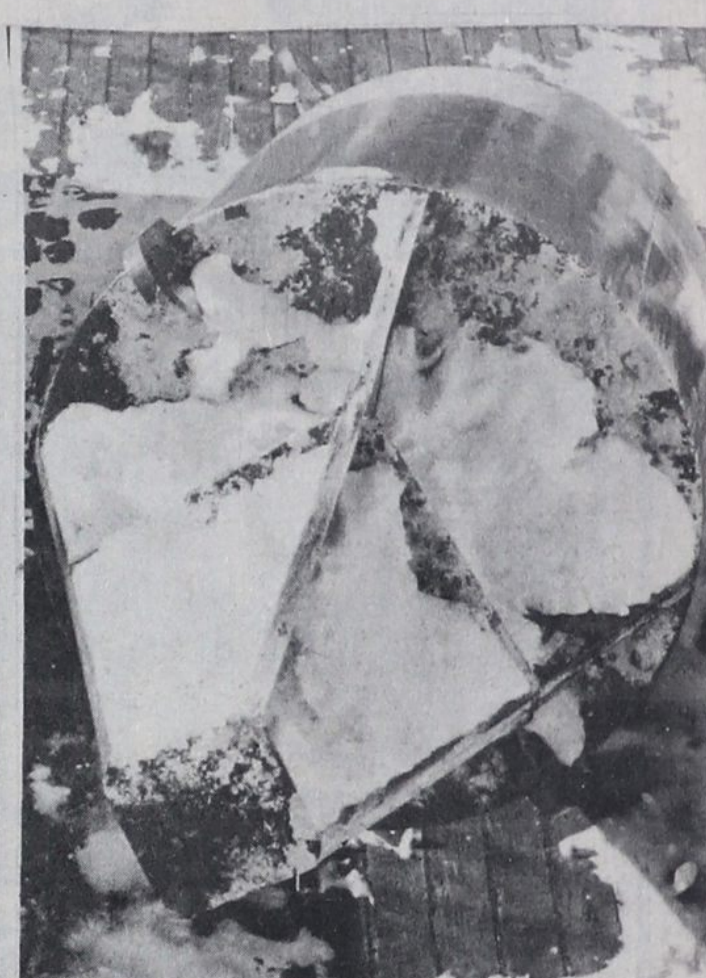
Aboard CCGS Montmorency: through the camera's lens