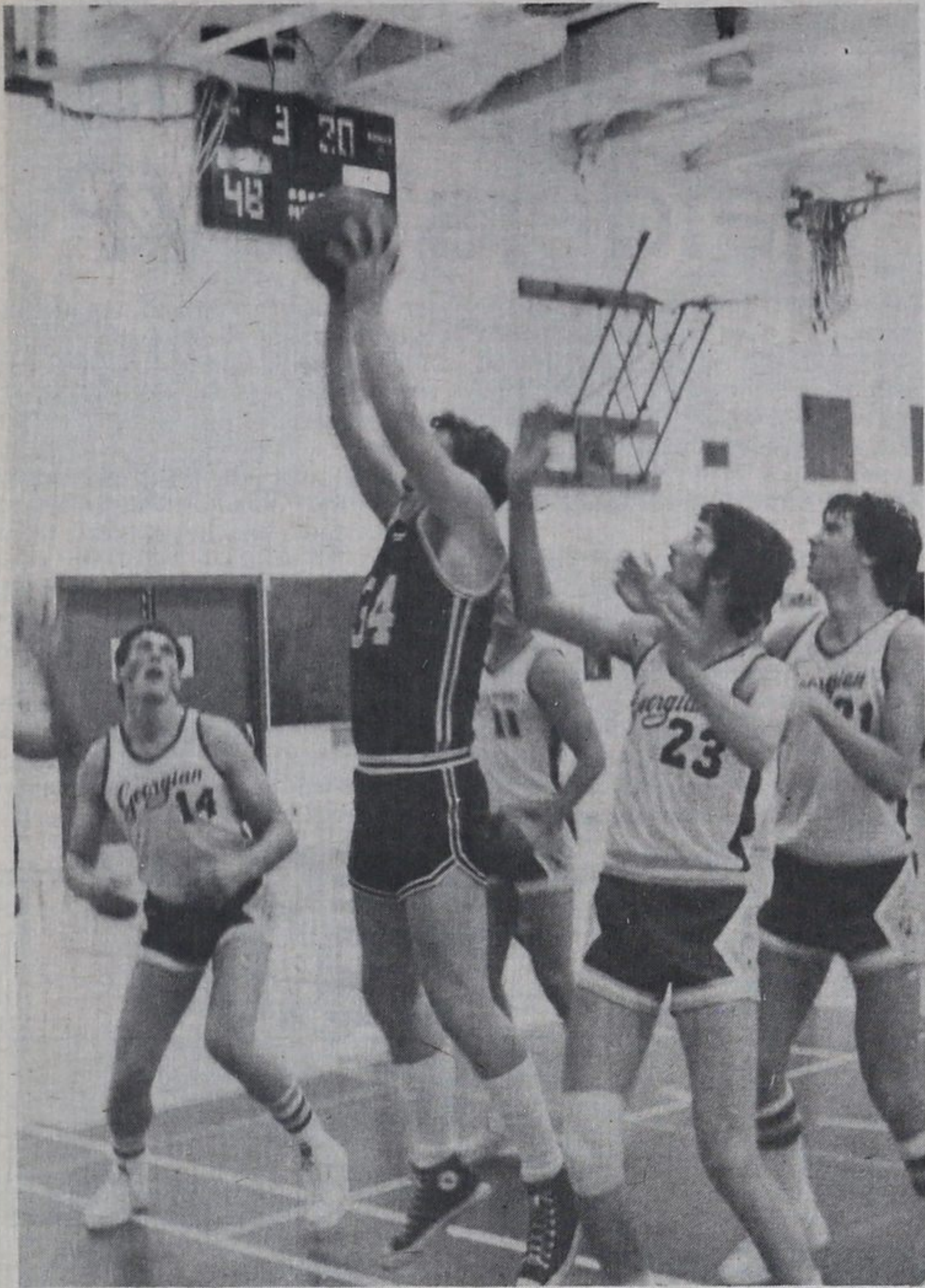
This is the way it's done fellas