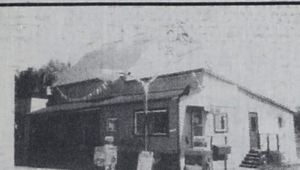
37. GREAT POTENTIAL

2-1 br and 1-2 br. apartments. Separate hydro meters.