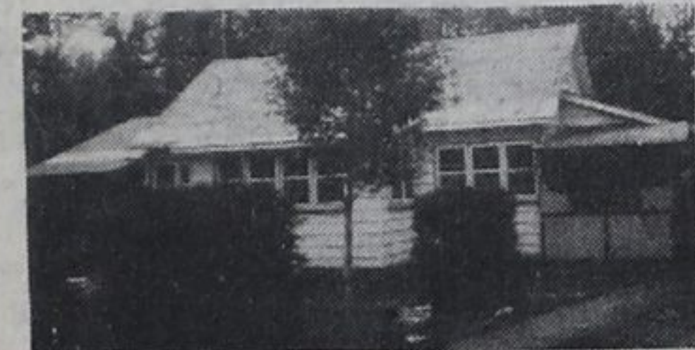
48. CHOICE BALM BEACH AREA

Only $42,900. for cottage with quality furnishings throughout. Separate vanity and toilet. Barbeque in landscaped setting. Dble paved drive, carport & workshop.