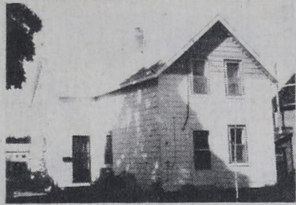
32. VIEW OF BAY

Four bedroom aluminum sided home on large lot in Midland. Excellent condition. Owner will assist with mortgage. Government grant available to first time buyer. $33,500.