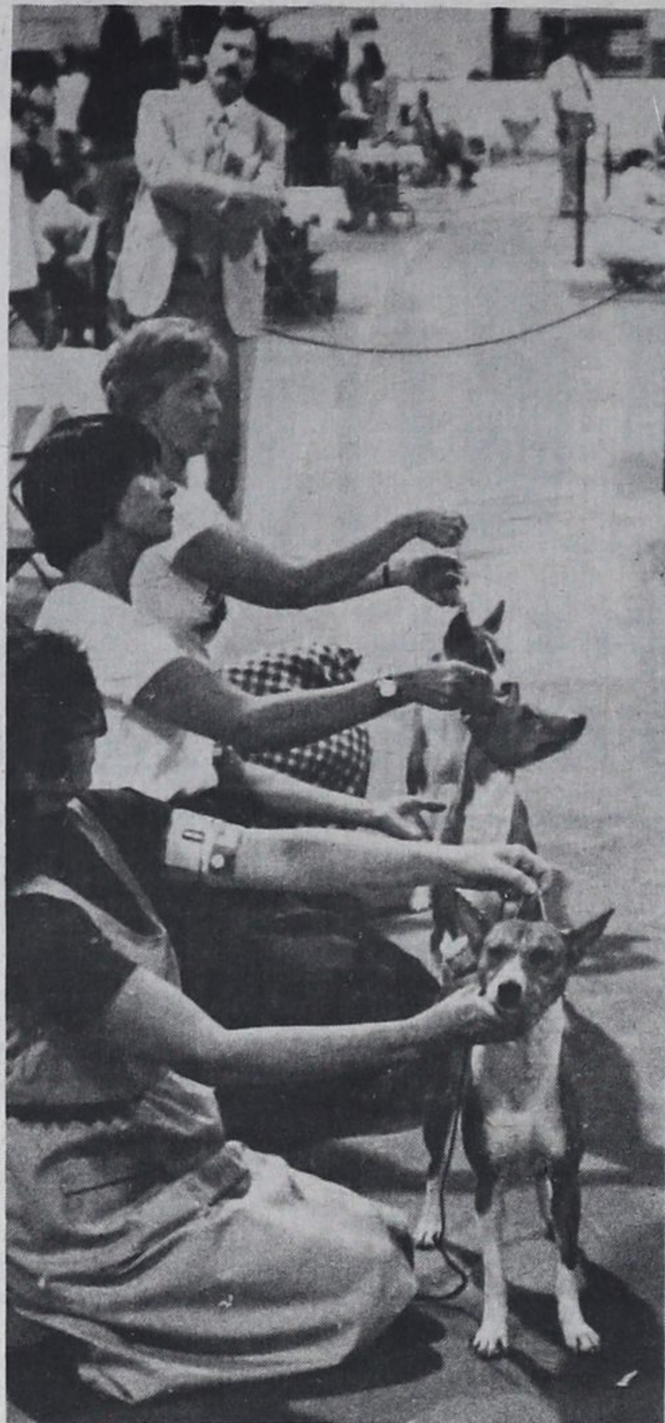
Owners work with dogs at last year's show