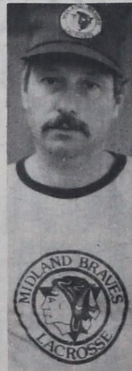
Price Off to B.C.