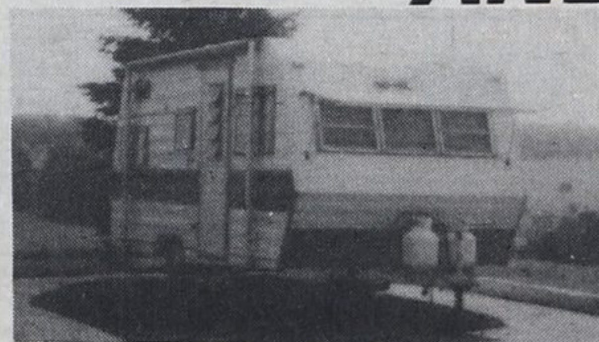
1974 17' GLINELLE TRAVEL TRAILER 3 Burner stove, 3-way fridge, furnace, roll-up awning, toilet, like new.