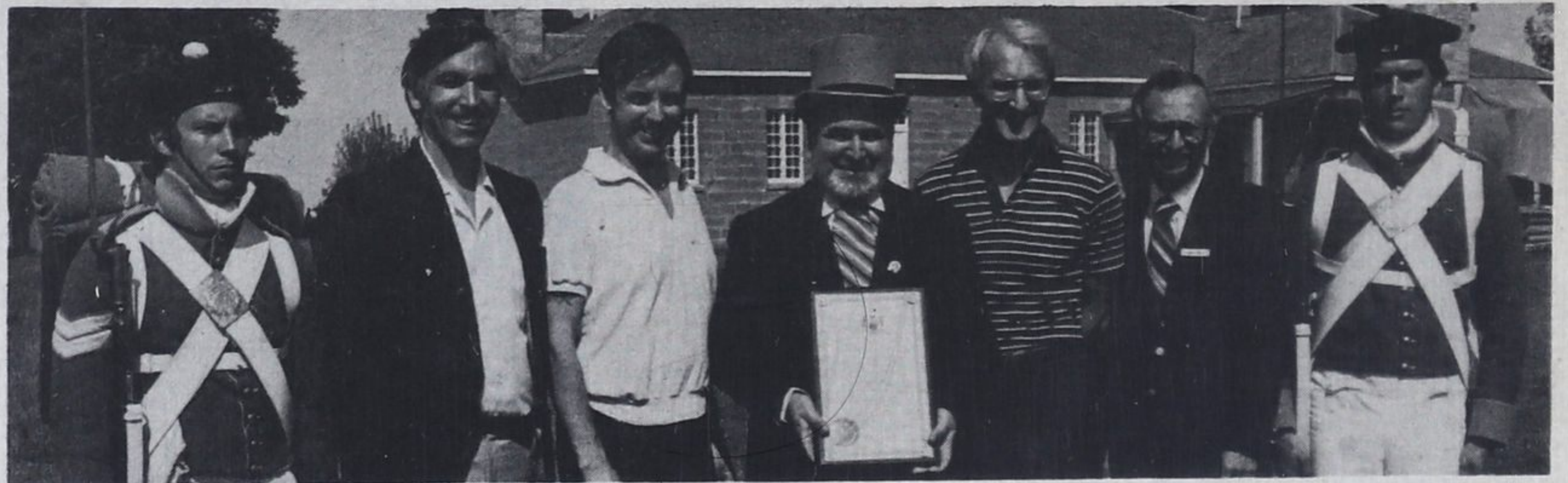
Only in 100 years