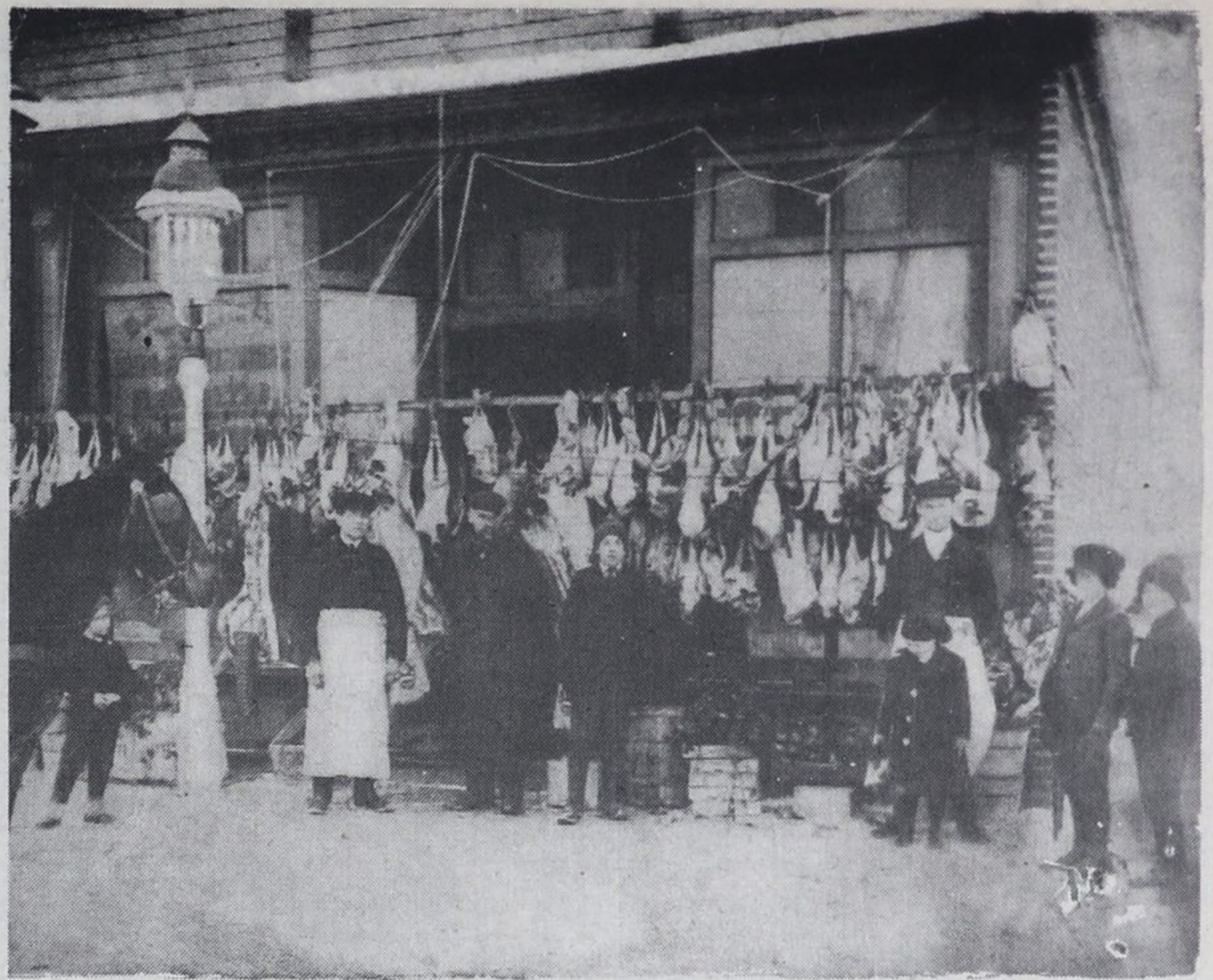
Centennial Scrapbook - print from the past

There may not be enough ex-Midlanders to go around...watch this space for more hot news from the Homecoming Committee. Cheerio, and Happy Homecoming!