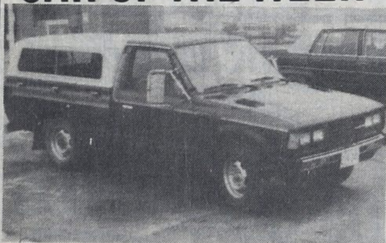
1981 DATSUN TRUCK Sport stripe, Cap, 4 speed standard, rear step bumper. $6,500.