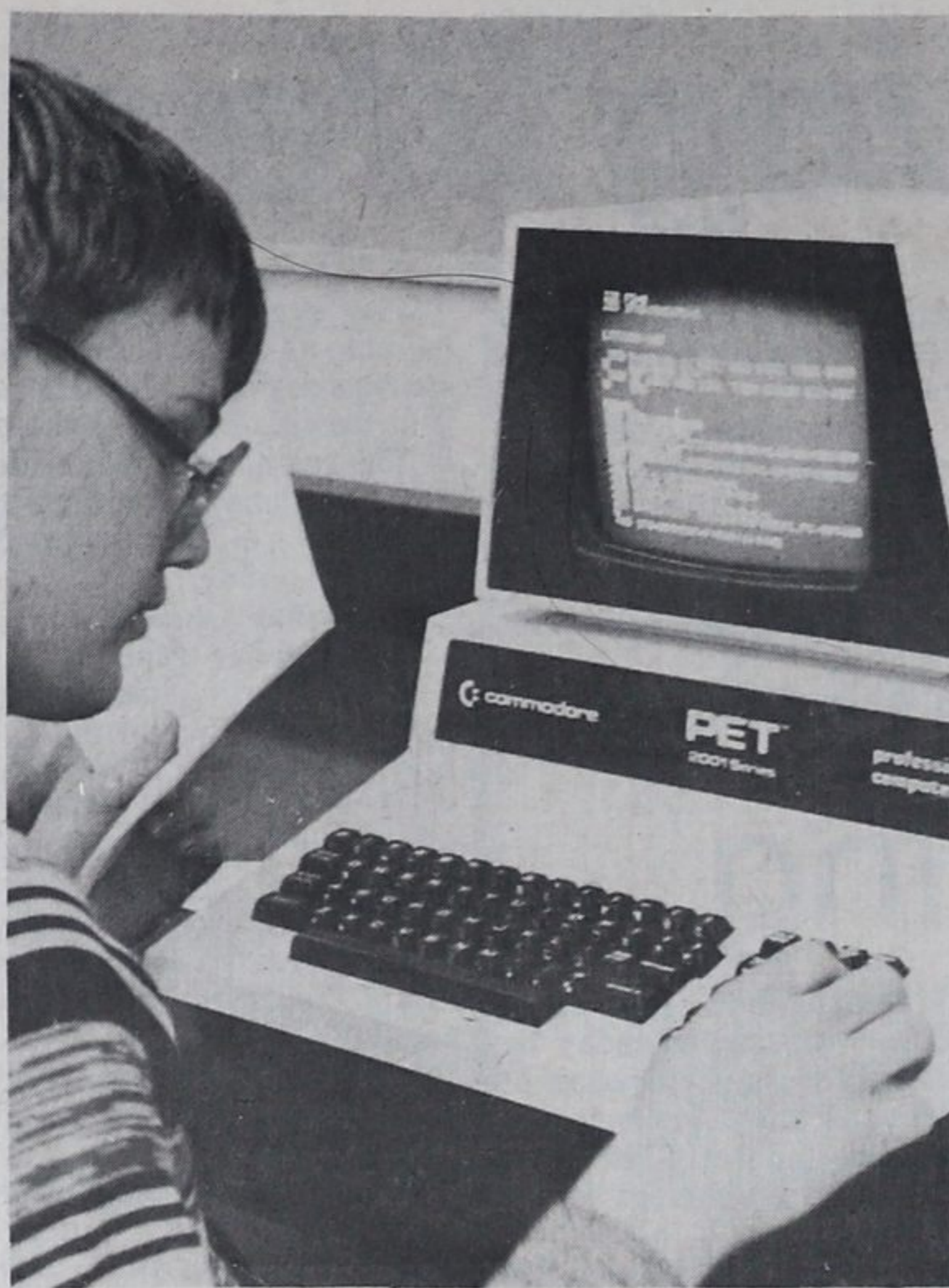
Data bank analyst

Stoneleigh has a large service department to keep you the customer satisfied long after you have driven off their lot.