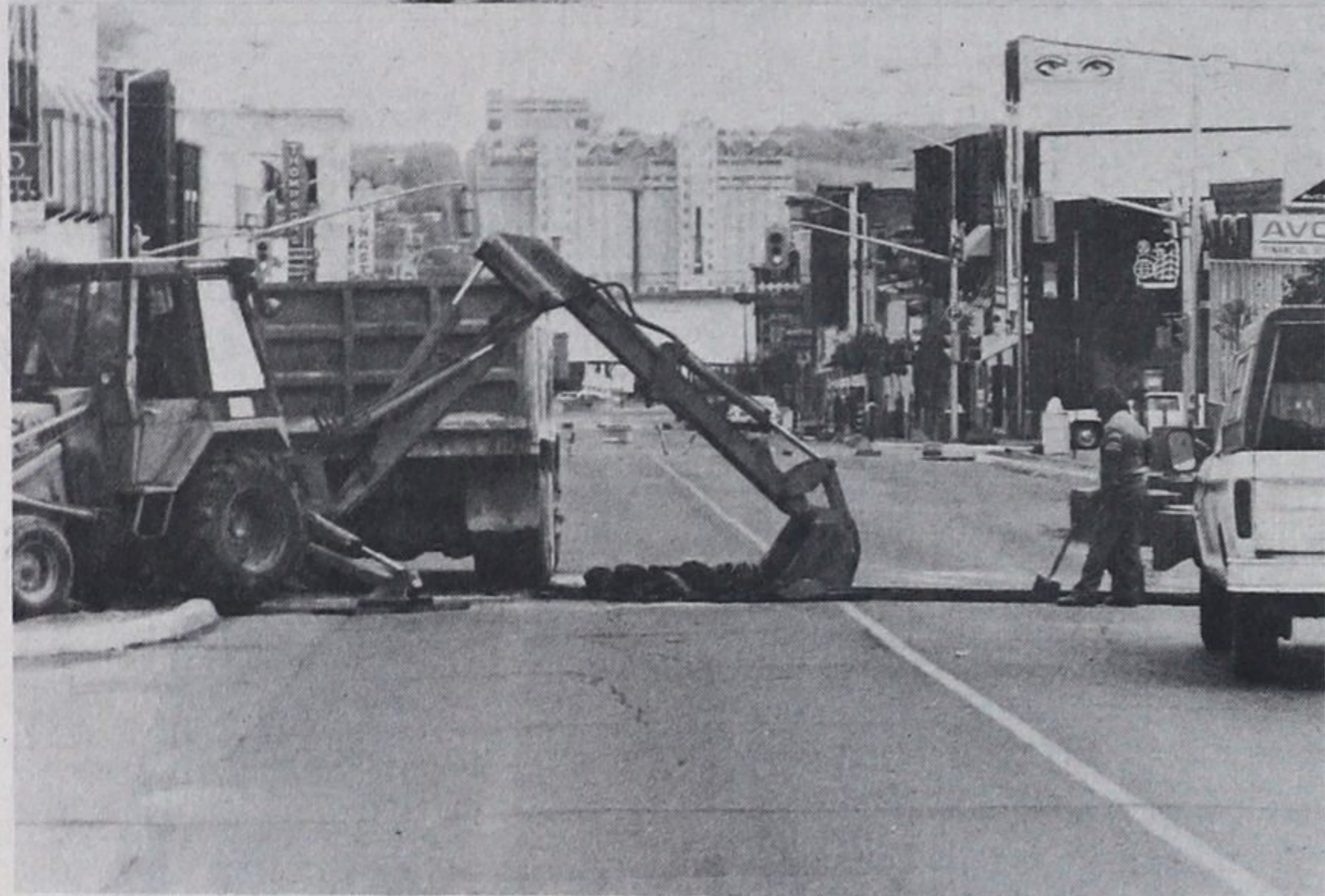
Paving Midland's future