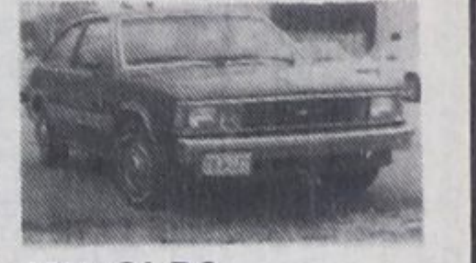
1981 OLDS OMEGA 6 cyl., auto., 4 dr., ps., pb., 43,000 kms., a very clean car. Lic. RWP 882. $7,295.