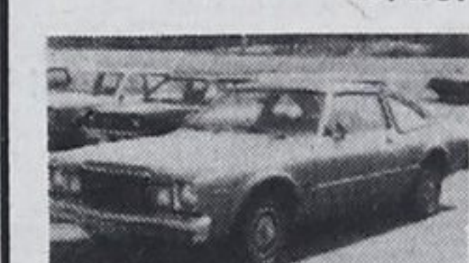
1979 PONTIAC GRAND LEMANS 305 V8, auto., 2 dr., ps., pb., bucket and console, 36,000 kms. Lic. RWP 884. $6,495.