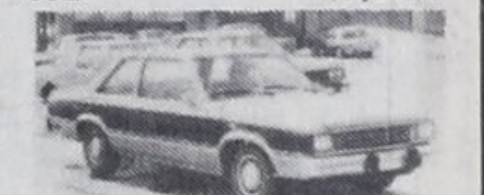
1980 PONTIAC PARIISIENNE 4 dr., 267 V8, auto., ps., pb., air, p/ windows, tilt wheel, stereo AM/ FM, two-tone Blue. 27,000 kms. Lic. PYZ 518.