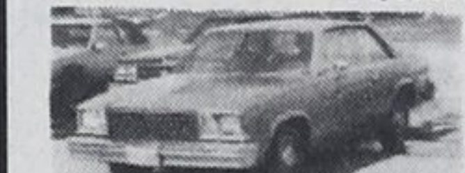
1979 BUICK SKYLARK V-6 , auto, 2 dr, ps, pb, 46,000 kms. RLV 642 $5,495.