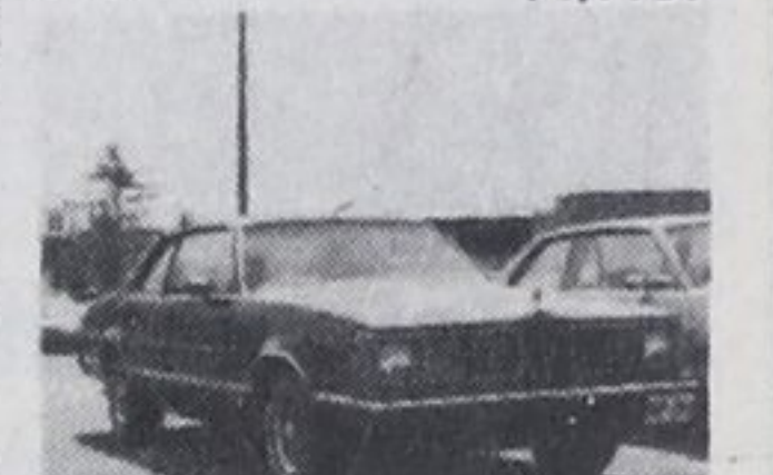
1979 PONTIAC LAURENTIAN STATIONWAGON 305 V8, auto., ps., pb., 56,000 kms. Lic. PCY 055. $5,295.