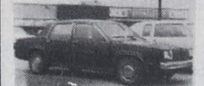
1980 FORD FAIRMONT 6 cyl., auto., 2 dr, ps, pb. New Michelin tires. PHN 624 5895.