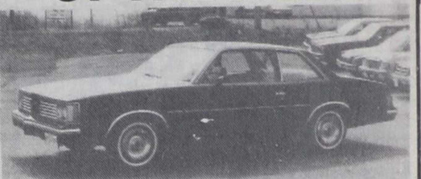
1980 PONTIAC LEMANS 2 dr., two-tone Black and Gold, 305 V8, auto., ps., pb., 31,000 kms. Lic. PCX 993. $7,495.