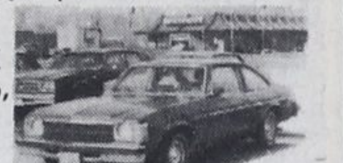
1979 PLYMOUTH VOLARE 2 dr, Landau roof, 45,000 miles. Lic. OAC 013. $4,995.