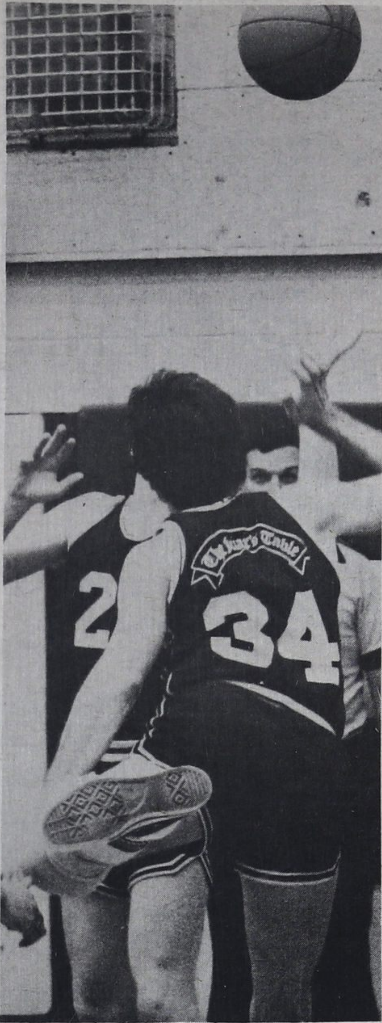
The Commodores had no trouble grabbing a big win over Georgian in SCMIBL play Wednesday in Barrie. Story page 9.