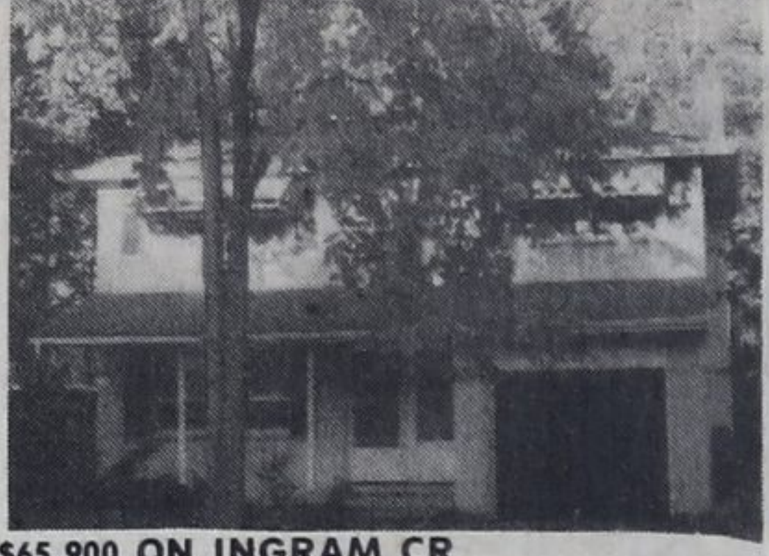
$65,900 ON INGRAM CR Two storey 4 bdrm home with garage, private deck, eat-in kitchen, 2 baths, cheap heating costs, proximity to high school and malls. Mary Thompson. No. 52.

YOUR OWN PRIVATE POOL & DECK $32,500. Buys this lovely 3 bdrm, broadloom throughout, large lot, 5 pc bath Mobile home w/above ground pool & cedar deck. Patti Torrance. No. 21.