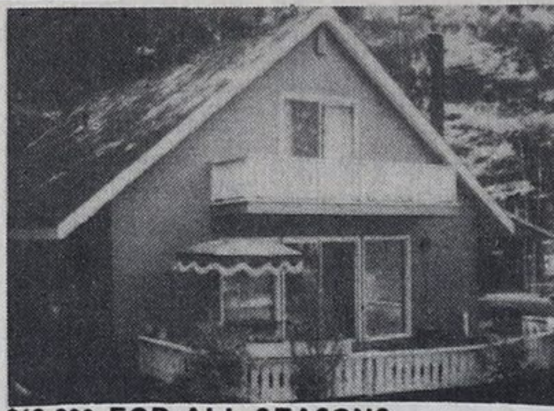
$63,900 FOR ALL SEASONS Chalet style on large lot, cedar patios, 4 bdrms beautifully decorated, lge living room and fireplace. Radiant heating. Jack Scott. No. 45.