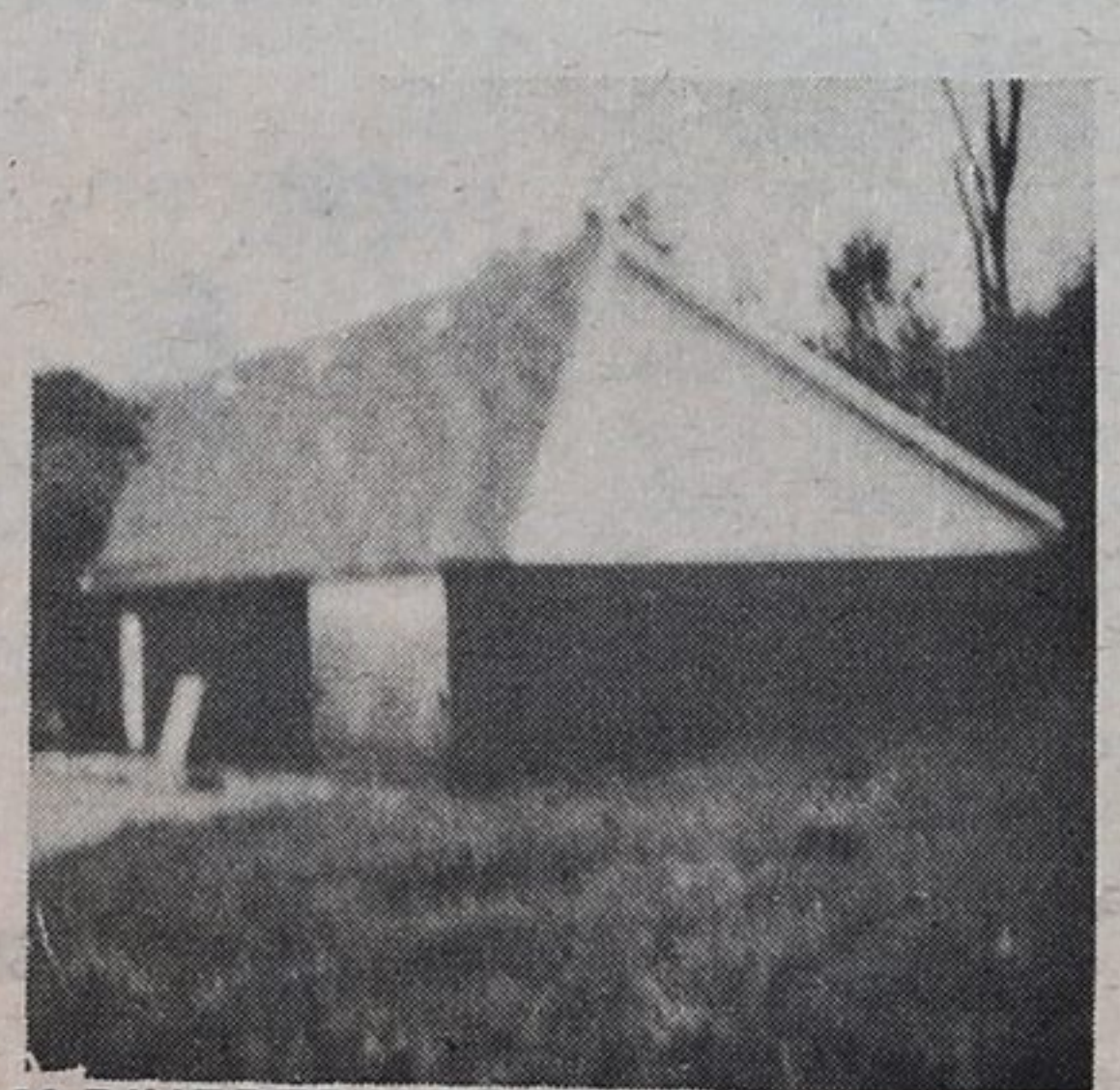
10. RIVERFRONT HOMESITE 3 acre parcel includes 900 sq. ft. metal clad bldg. insulated oil furnace fluorescent lighting & storage loft-new well driveway on con 3 Tiny.