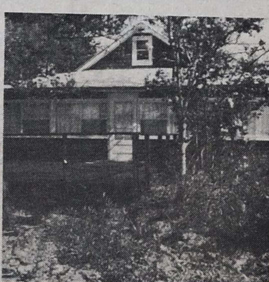
7. WATERFRONT BL81 / 06 Bluewater Beach 4 bdrms, wrap-around verandah, utility, good heating, and fp. very nice.