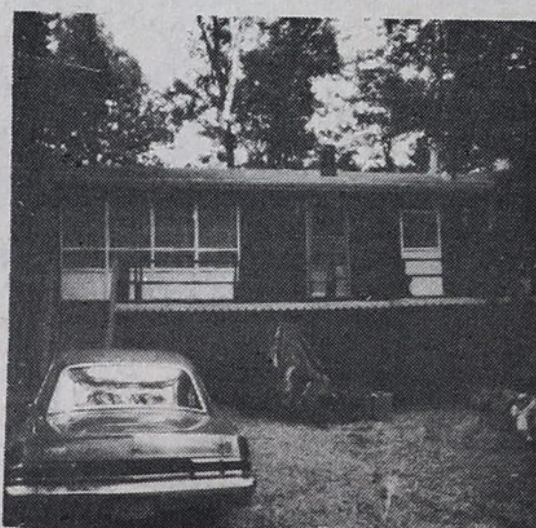
3. DEANLEA BEACH MLS nice and large five bedrooms, two decks, fireplace and franklin carpeted and furnished full basement. see this one now! $47,000.