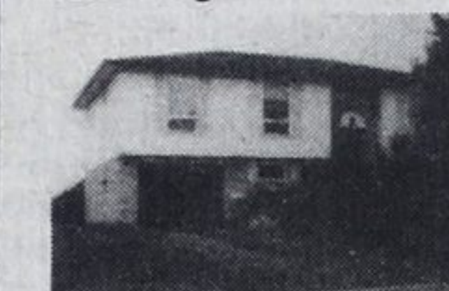
17. Extras! Extras! Inground pool from walkout fam. rm. 9 1/4 mtge 'til 1998.