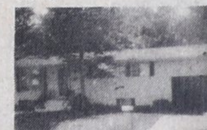
16. Beautiful Dufferin St. bungalow. $59,900. with 10 1/2 per cent mtge.