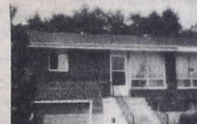
8. Three bdrm semi with rec rm. Only $36,000. with 14 1/2 per cent mtge.