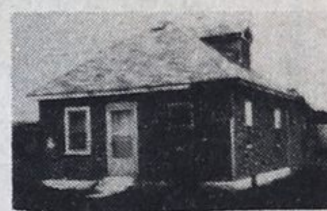
2. Pt. McNicoll 4th St. $24,000 with 11 1/4 per cent mortgage. Low down pay't.