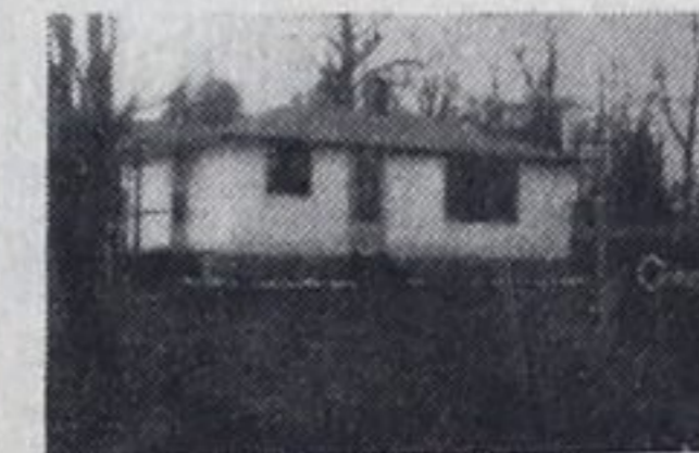
19. Three bdrm cottage, Ouida St., big 99'x165' lot. $27,500. 11 1/2 per cent mtge.