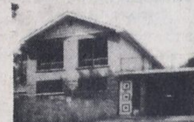
12. Reduced $49,500. with 15 per cent finance by vendor. Many extras here.