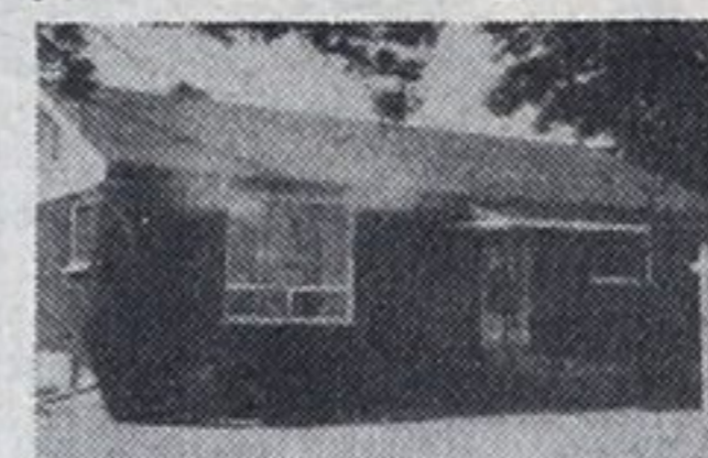
10. Red brick bungalow, 2 bdrm. $39,900 with 15 1/2 per cent mtge.