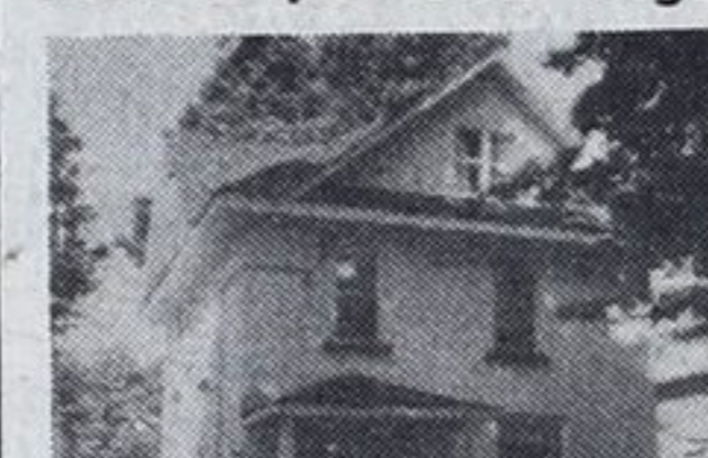
9. Lge. Manly St. home. Reduced $37,900 with 9 per cent mtge.