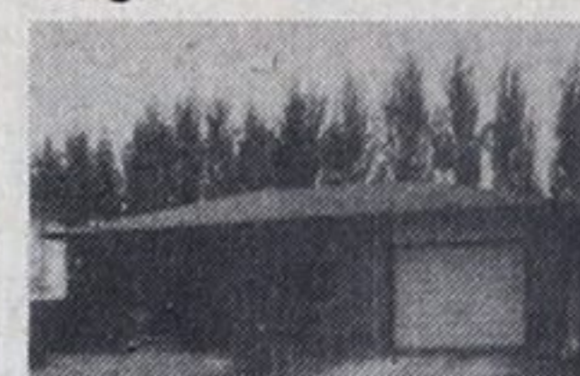
15. Cedar St. Reduced to $55,500. with 10 1/4 per cent mtge.