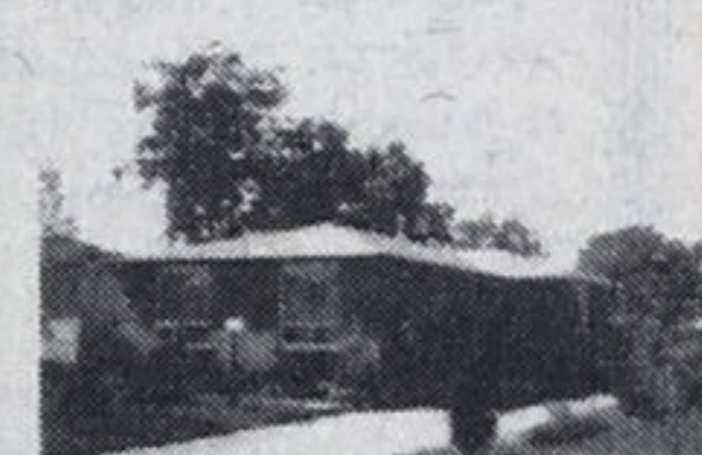
14. Glen Bogie bungalow beauty, many extras. $55,900. 11 1/2 per cent mtge.