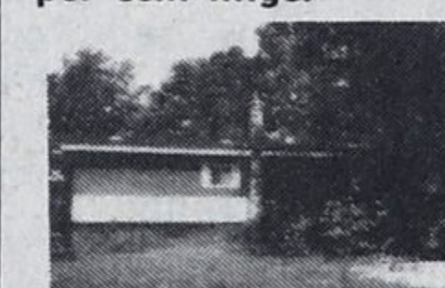
13. Waterfront home close to Midland. $55,000. with 14 3/4 per cent mtge.