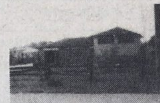
11. Perkinsfield 3 bdrm, rec rm., Florida rm., $46,900. with 16 per cent mtge.