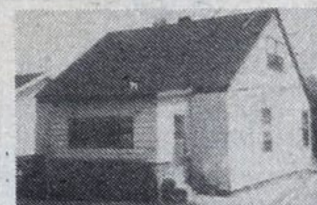
5. Four bedrooms in this spacious home. $29,900 with 10 per cent mtge.