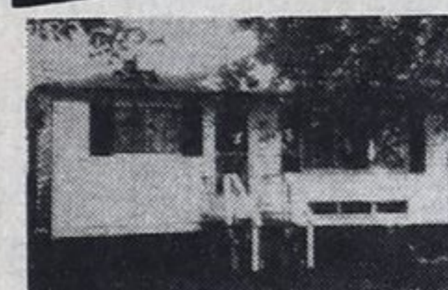
1. McNicoll St. 2 bdrm. Only $23,900. with 16 per cent mortgage.

Here are some good examples of our listed properties "lower-than-usual" financing available to qualified purchasers.