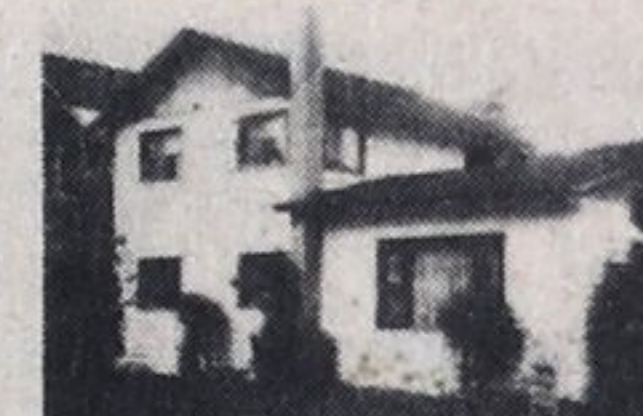
7. West side 3 bdrm plus rec rm. $35,500 with 10 3/4 per cent mtge.