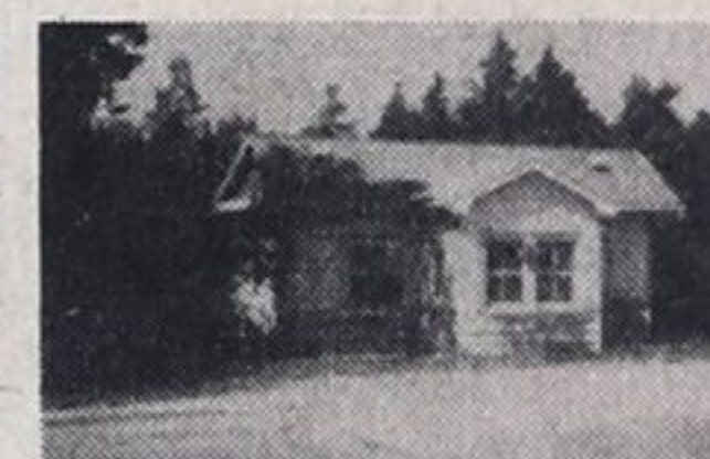
3. Vinden St. 4 bdrm plus at only $27,900. Has 1st mtge 10 per cent.