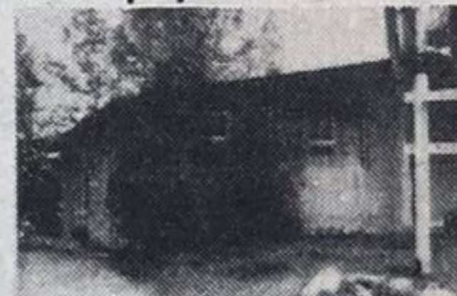
6. Everton Rd. semi. Only $32,900. with 12 1/2 per cent 1st mtge.