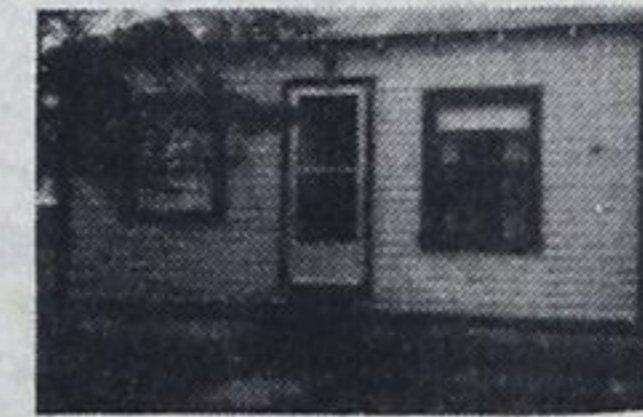
18. Cottage, 2 bdrm, lge lot. Paradise Pt. $25,900. with 14 per cent mtge available.