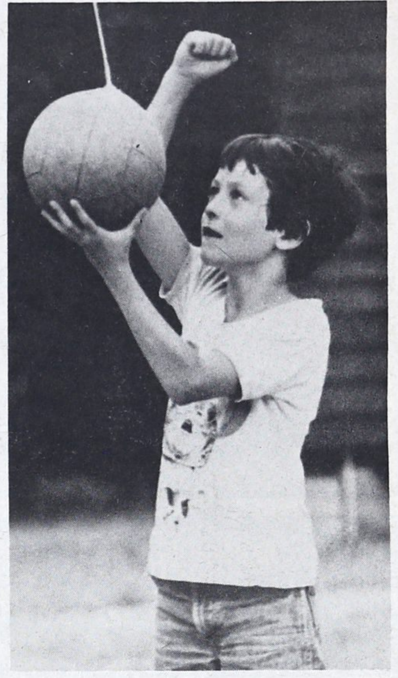
One of camp's games