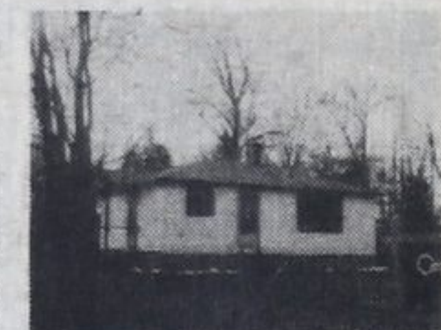
3. Waubashene Price $27,500. Mtge. 11 1/2 per cent.