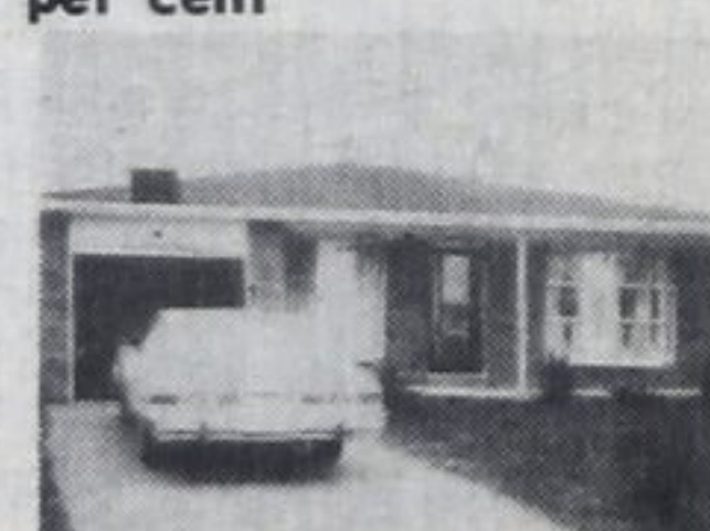
15. Algonquin Dr., Price $69,900. Mtge 11 1/2 per cent.