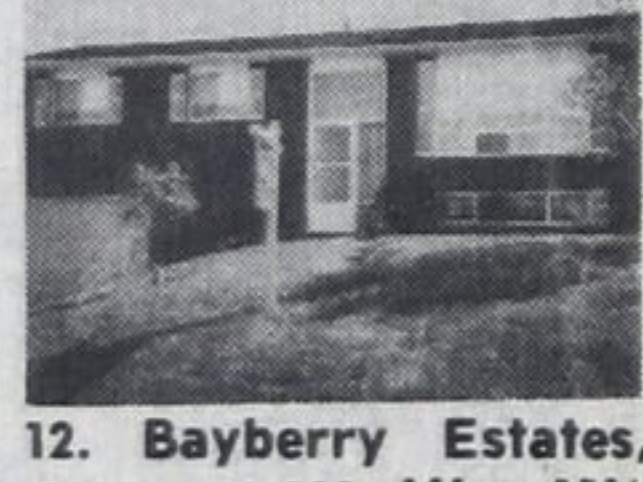
12. Bayberry Estates, Price $42,900. Mtge 11 1/2 per cent