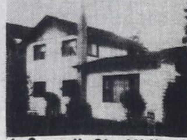
6. Seventh St., Midland, Price $35,500. Mtge 10 3/4 per cent