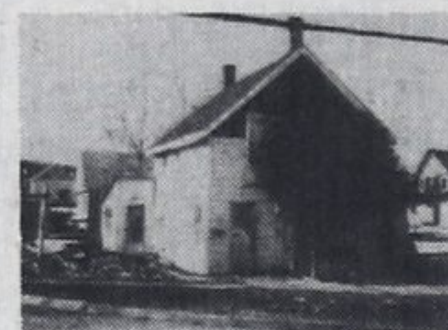
2. Fifth St., Midland, Price $25,900. Mtge. 11 per cent.