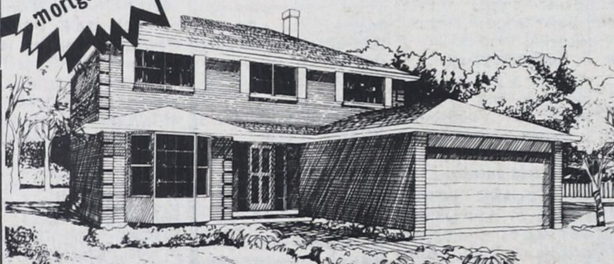
THE ARISTOCRAT - $85,000. ARTIST'S CONCEPT

4 bedroom, 2 storey, family room, 2-4 pce's and 2 pce. bath.