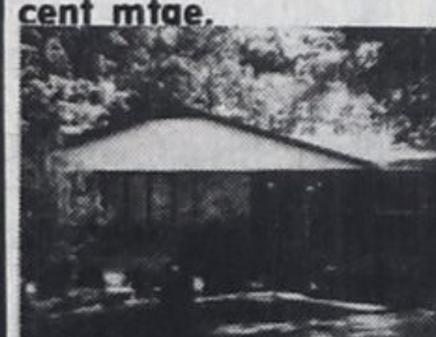
13. Sunnyside custom. $58,500 with 11 per cent mtge.