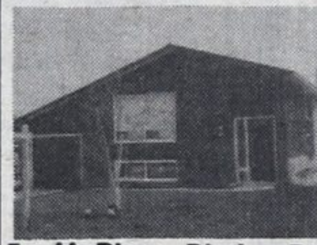
7. McPhee Blvd., Pt. McNicoll, Price $38,900. Mtge. 11 3/4 per cent.