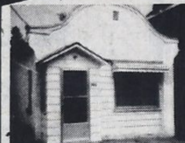
1. Good starter home. Downtown Midland $24,900.

Here are some good examples of our current listings