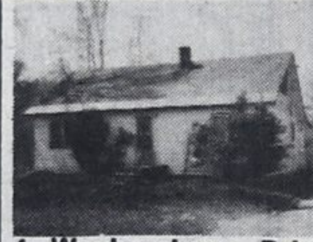
4. Waubashene, Price $27,900. Mtge 11 1/4 per cent