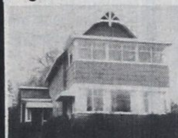
16 Duplex-2nd St., Price $39,900. Mtge 14 per cent.