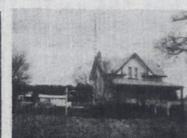
14. Large home on 2 acres, Hwy 27. Asking $53,900.