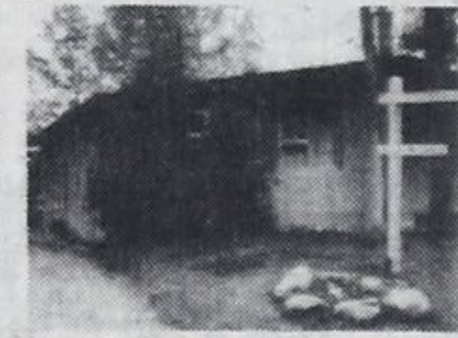
5. Everton Rd., Price $32,900. Mtge 12 1/2 per cent.