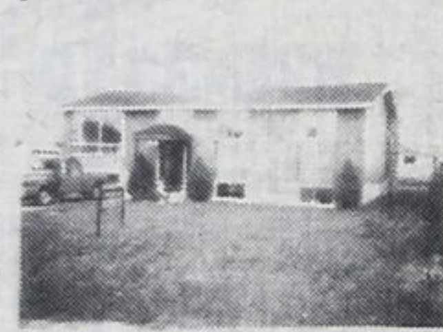
9. Franklin St. Pt. McNicoll, Price $42,500. Mtge 13 per cent.