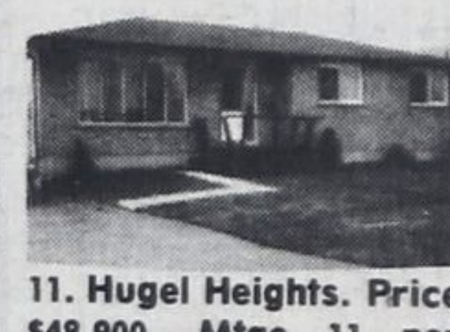
11. Hugel Heights. Price $48,900. Mtge 11 per cent.