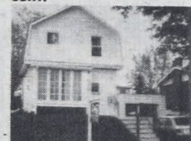
8. Hanly St., Midland, Price $39,900. Mtge 11 1/2 per cent.