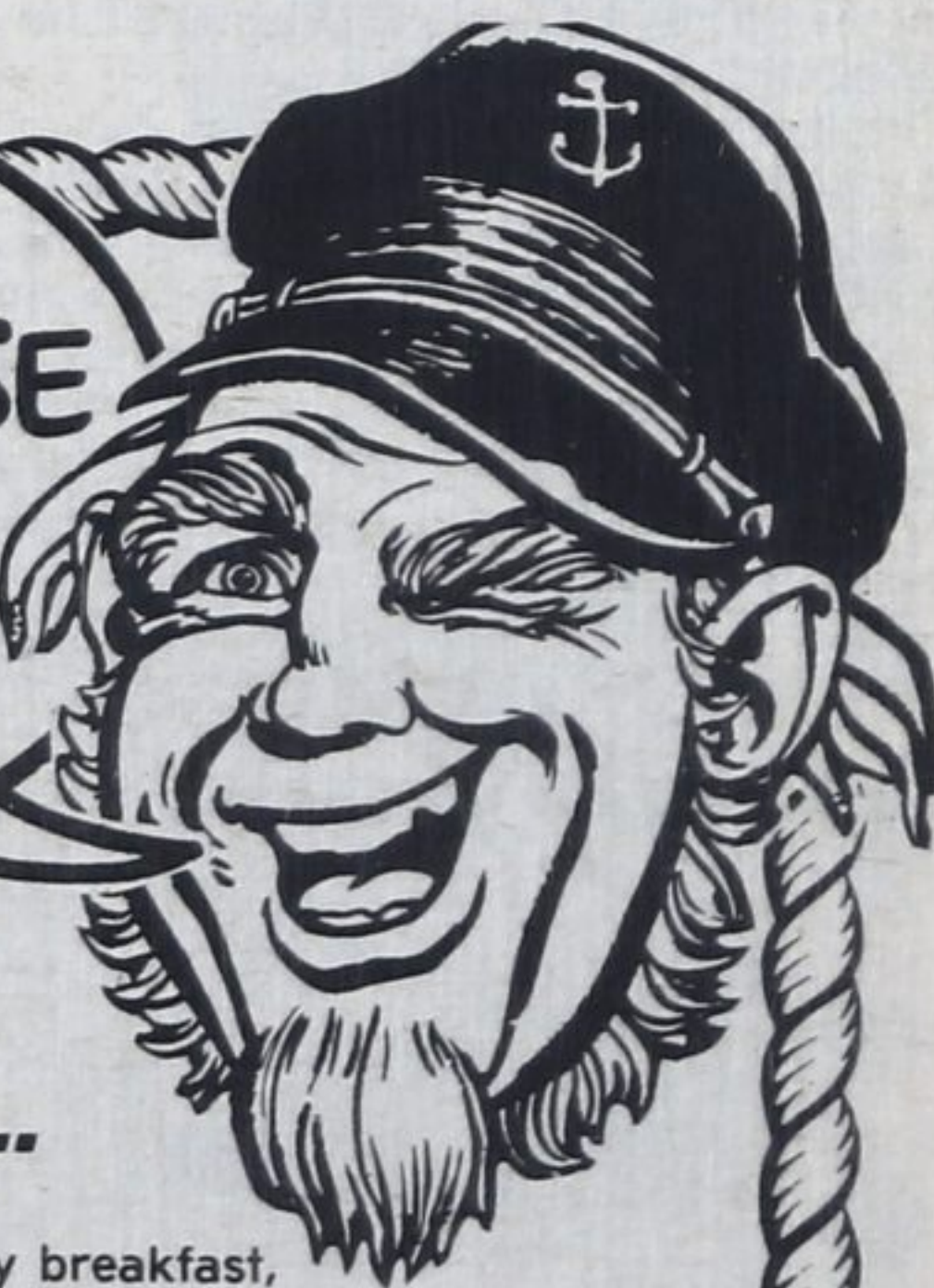
CHART YOUR COURSE FOR Bay Moorings Dining Lounge