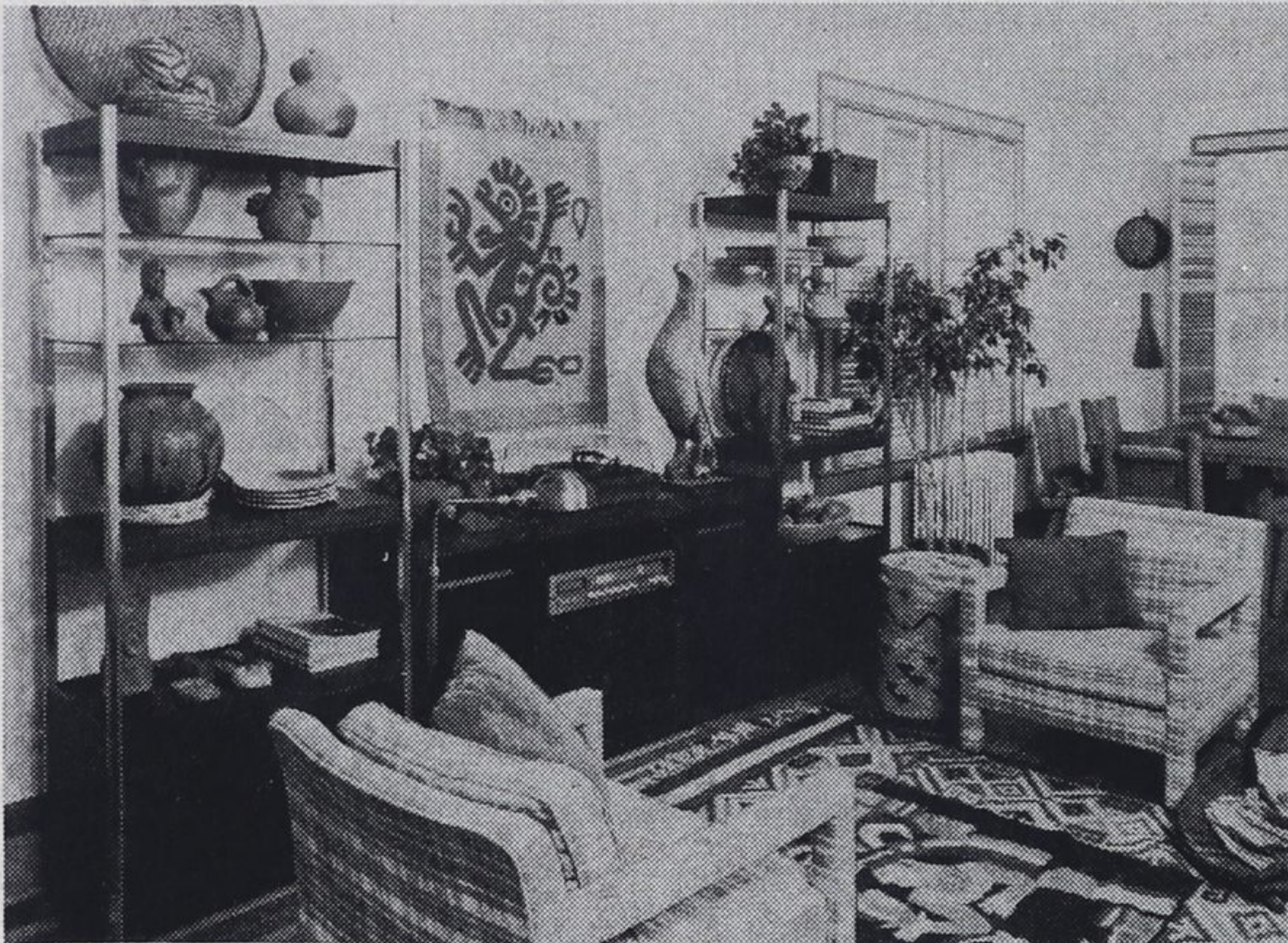
DESIGNER ALLEN SCRUGGS' ECLECTIC LIVING ROOM is planned around the owner's two main interests—music and his collection of Mexican pottery. This tiny, early 1900s home, originally a farmhouse, had a long, narrow living room. Functionally broken in two for living and dining, the room is all-white with old shutters stripped to natural wood.

• Remove peeling paint. Before repainting any surface, eliminate bits of flaking paint with the drill sander. You'll get better results!