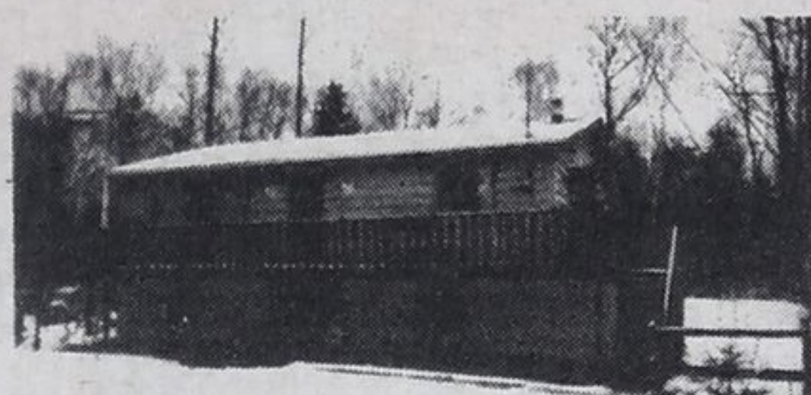
3 BDRM BUNGALOW - TRIPLE BAY $45,900 — Large rec. room with Fisher stove. Walkout basement, water access. Marjorie Contois.