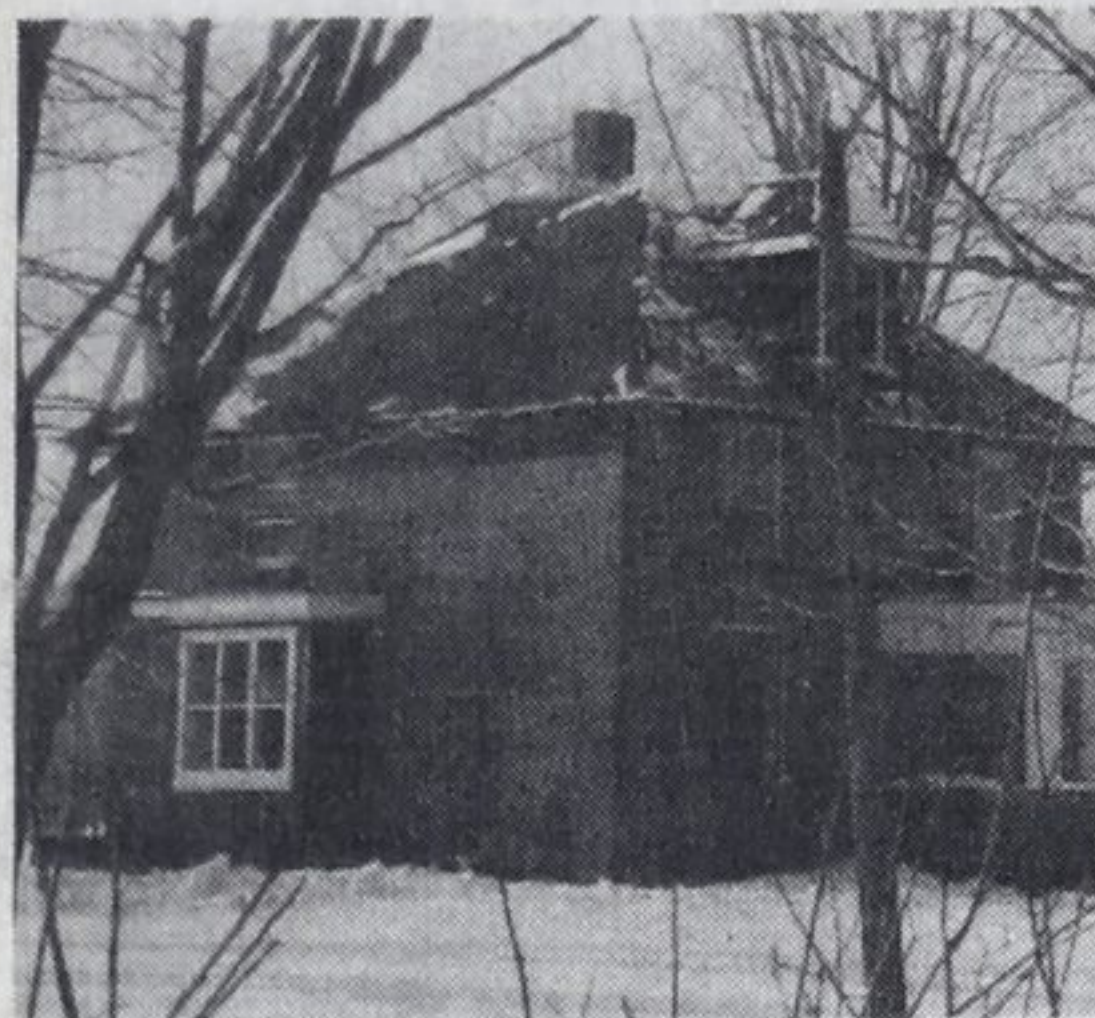
INVESTMENT AND HOME $165,000 — Buys 5 acres residential property inside Midland town limits. Large brick in excellent condition. Clarence Lee.