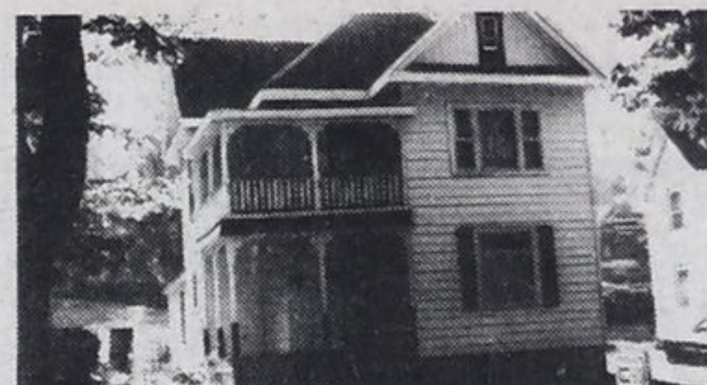
IMMACULATE REMODELLED HOME $47,900 — 3 bdrms, large family kitchen, spacious living room, good location, close to schools and shopping. Mature trees. Marjorie Contois.