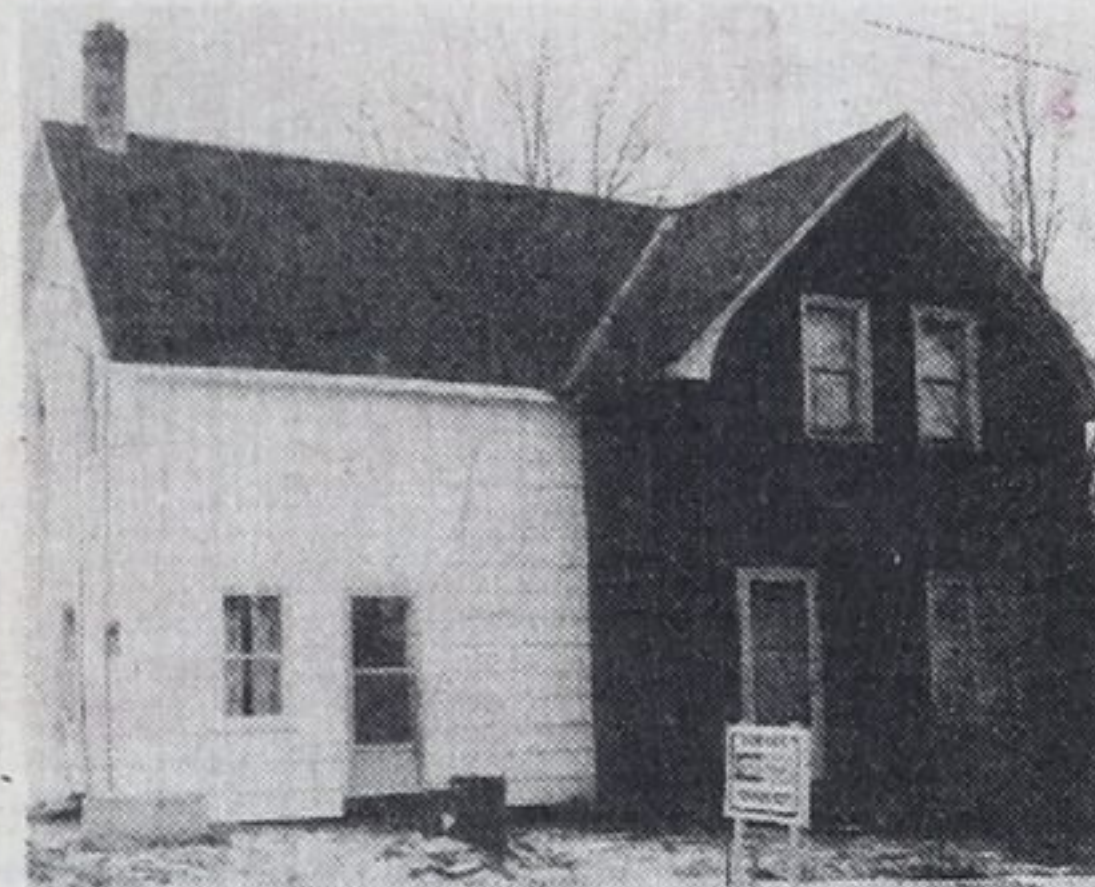
HANDYMAN'S DELIGHT - $18,900 For the person who would like to remodel and refinish this two storey, three bedroom home. Large, beautiful lot. Patti Torrance.