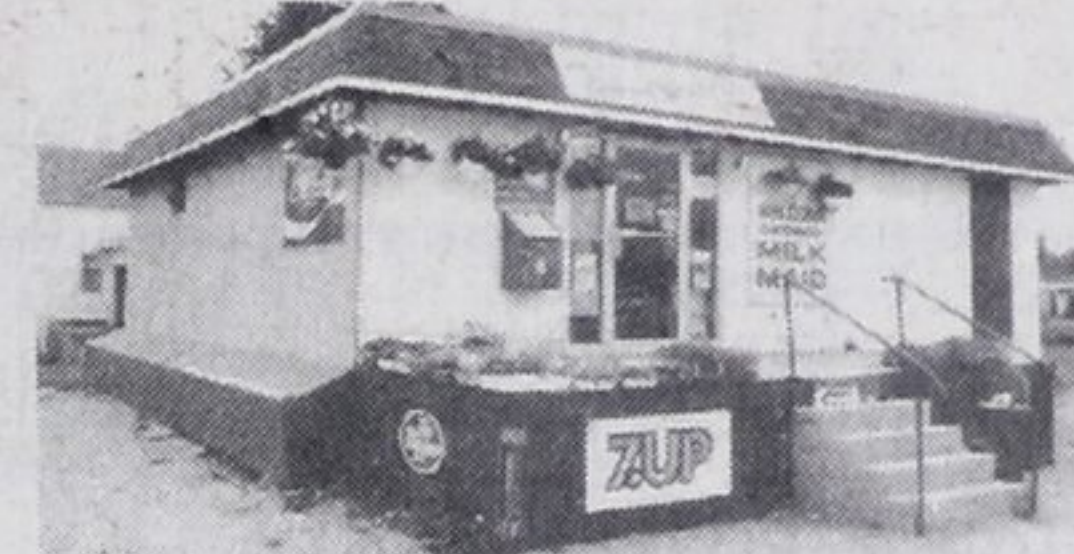
POST OFFICE, HAIR DRESSING AND VARIETY STORE $49,000 — Hwy. 27, Wyebridge services entire village. Great potential and room for expansion. Marjorie Contois.