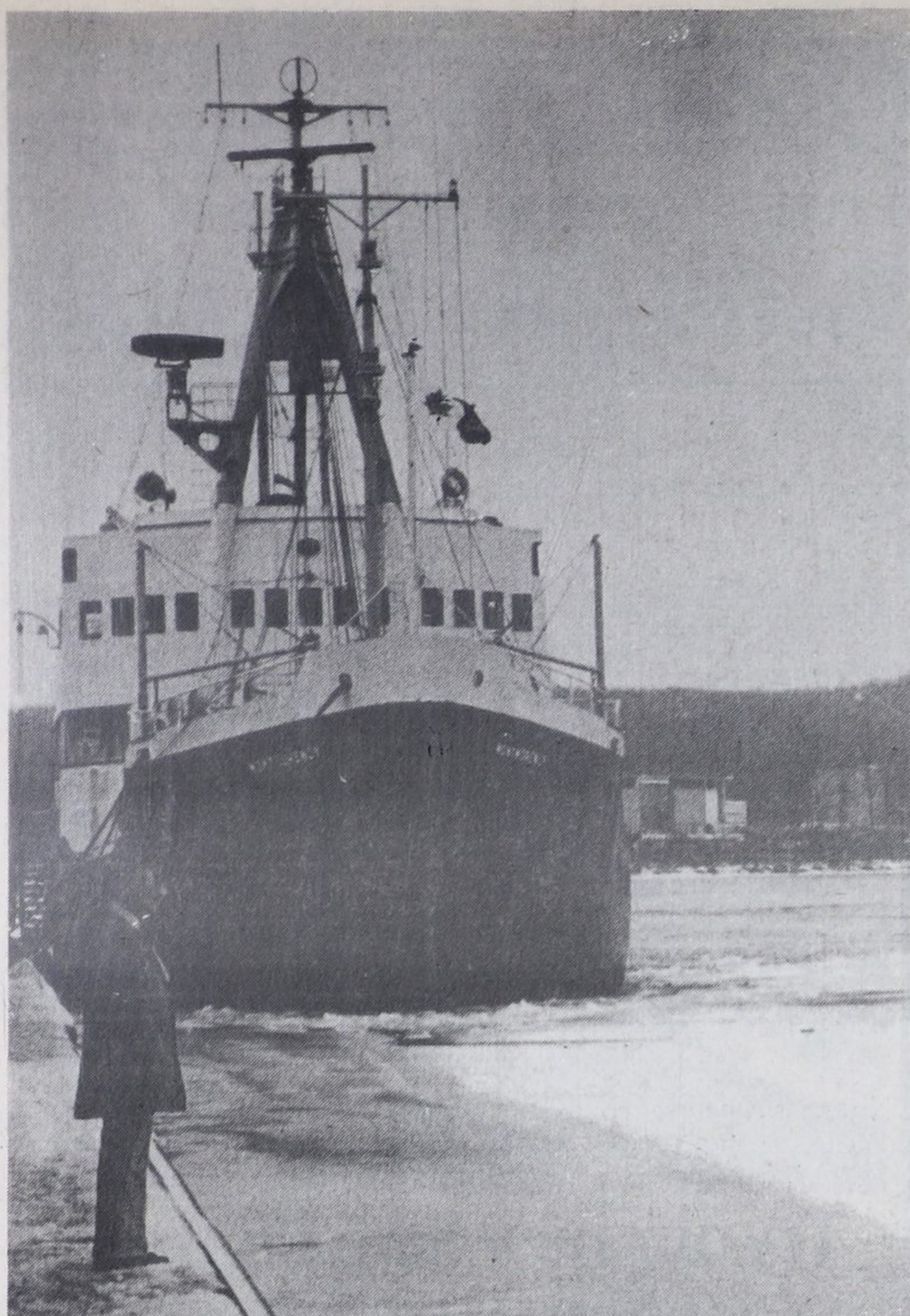
C.C.G. ships Montmorency and Griffon could be heading to open water to begin the 1981 shipping season