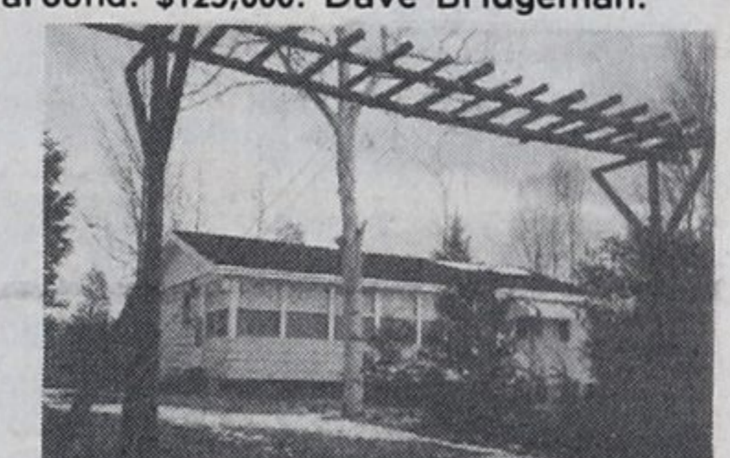
GEORGIAN BAY ESTATES $34,500 — Backs onto waterfront park, cedar plank lined 3 bdrm cottage on 100 x 150 ft landscaped lot. On year round road. Frank Wristen.