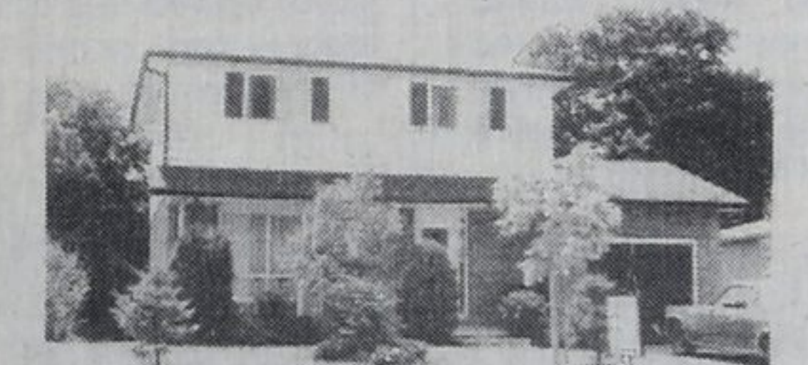
$48,900 - MIDLAND 7-YEAR OLD Very well kept 4-bdrm home with full finished basement, 2 baths, gas heating. Mary Thompson.