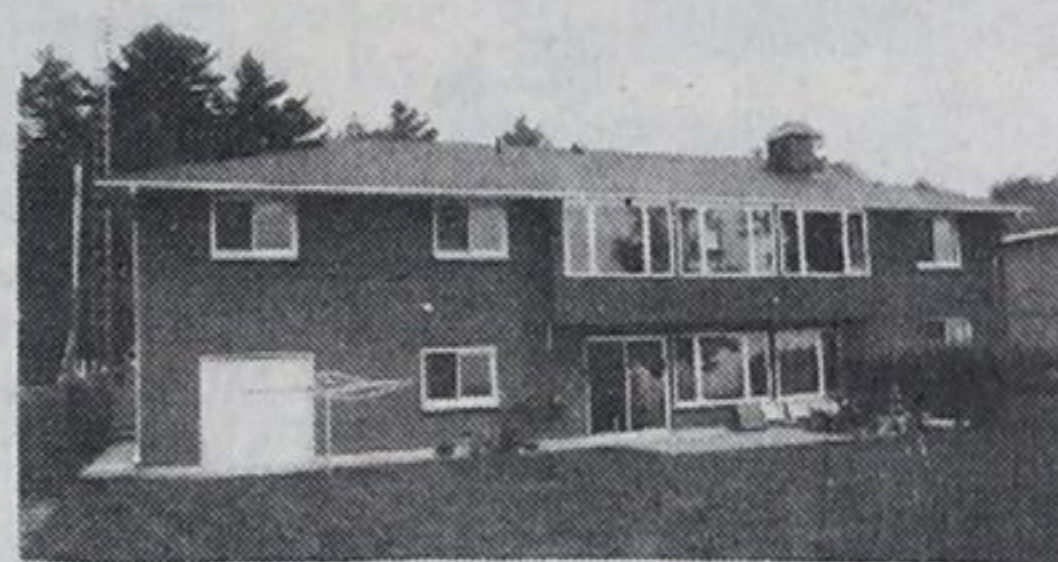
CUSTOM WATERFRONT Architect designed, 4 bdrms, 2 1/2 bathrooms, 2 fireplaces, plaster walls, fenced yard, and the best sandy beach around. $125,000. Dave Bridgeman.