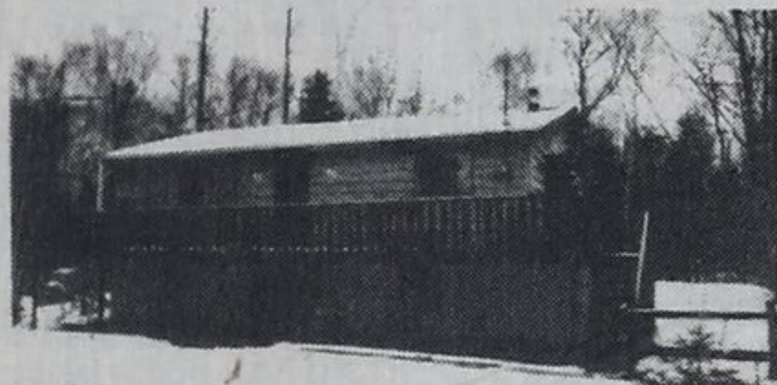
3 BDRM BUNGALOW TRIPLE BAY $45,900 — Large rec. room with stove. Walkout basement. Water access. Marjorie Contois.