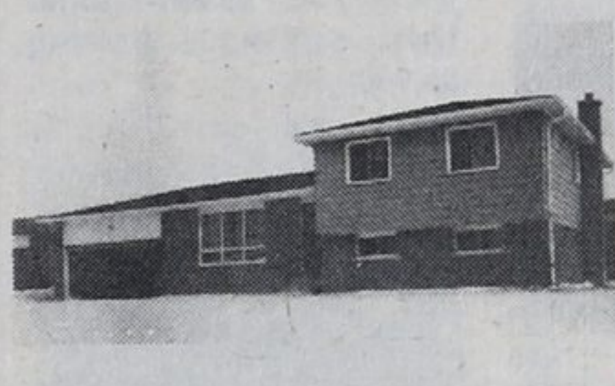
$53,900 - 3 BDRM SIDESPLIT Eat-in kitchen, family room with brick fireplace, full basement, fully sodded. New subdivision, east-end of town. Call today.