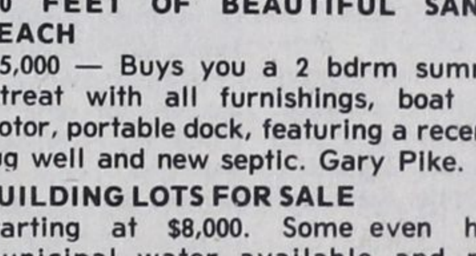
170 FEET OF BEAUTIFUL SANDY BEACH $35,000 — Buys you a 2 bdrm summer retreat with all furnishings, boat and motor, portable dock, featuring a recently dug well and new septic. Gary Pike.