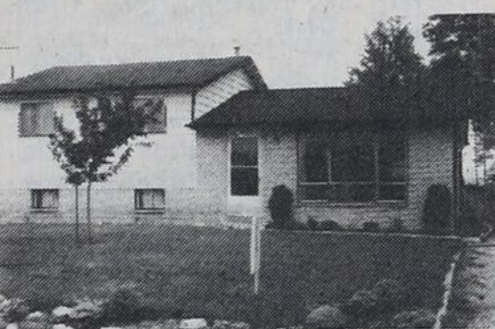
$37,500 - PRICED TO SELL Brick and aluminum 3 bdrm home in well kept rural area. Abuts community playground. 1/2 mile to RCA. Mary Thompson.