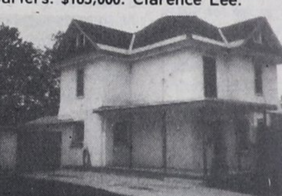
MAKE AN OFFER A well maintained 2 1/2 storey, 3 bedroom house. Attached garage, fenced in yard, 13 per cent financing. Only $42,500. Dave Bridgeman.