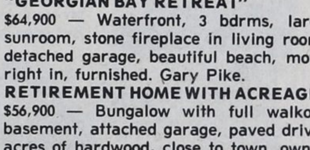
"GEORGIAN BAY RETREAT" $64,900 — Waterfront, 3 bdrms, large sunroom, stone fireplace in living room, detached garage, beautiful beach, move right in, furnished. Gary Pike. RETIREMENT HOME WITH ACREAGE $56,900 — Bungalow with full walkout basement, attached garage, paved drive, acres of hardwood, close to town, owner may consider a first mortgage at a good interest rate. Gary Pike.