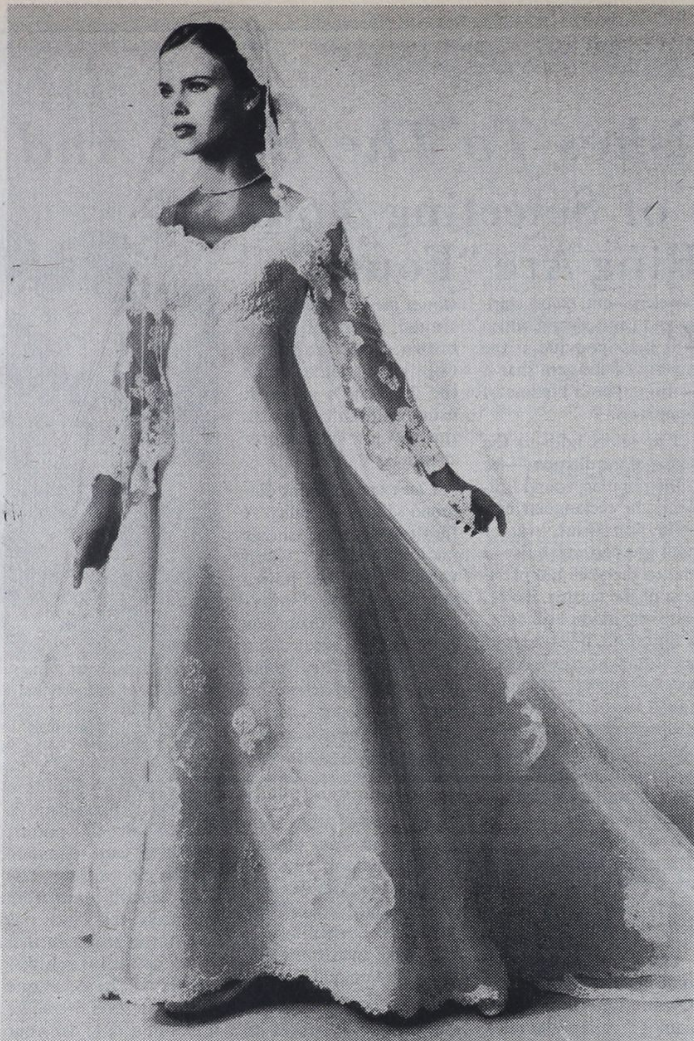
GOSSAMER LOVELINESS . . . the bride is a vision in a romantic gown by Priscilla of drifting starched chiffon, appliqued with an intermingling of re-embroidered Alençon and delicate Bristol laces. Open V neckline and slender, tapered sleeves grace the molded bodice. Lace motifs accent the skirt front above the lace-scalloped hemline and chapel train. Lovely Alençon and Bristol laces border the chapel-length mantilla, floating from an Alençon lace-covered cap.

Be sure to register, and make every wedding gift a joy for your friends to give, and even more of a joy for you and your future husband to receive.