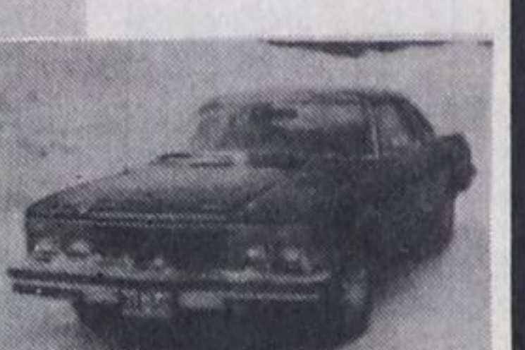
1978 HORIZON, 4 cyl., gas miser, 4 speed standard, trans., radio, rear defogger. $3,495.00