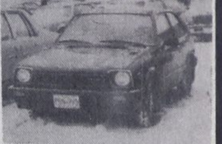
1980 MALIBU WAGON, 267, gas saving, V-8, auto., p.s., p.b., medium blue metallic, 17,000 kilos. Lic. PCX 952. $6,895.00.