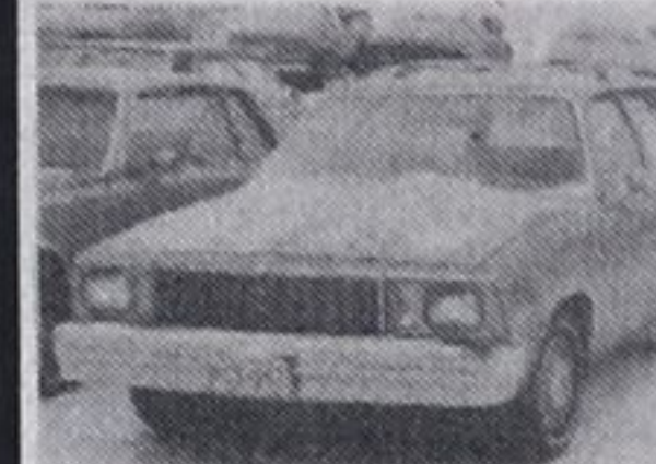
1978 CHRYSLER LEBARON, 2 door, 318 V-8, auto., p.s., p.b., custom split seats, ladies delight, 28,000 kilos. Lic. NXA 045. $5,795.00