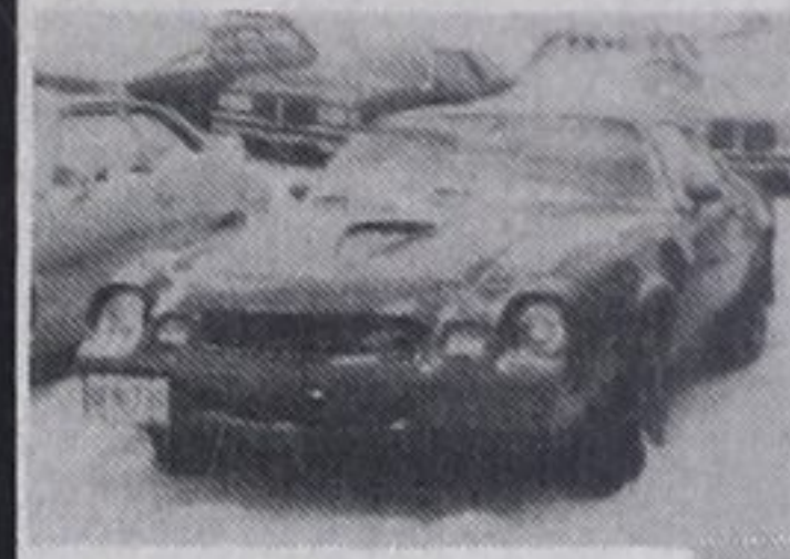
2 1980 FIREBIRDS, gas saving 267, V-8, auto., p.s., p.b., 20,000 kilos. Lic. PYT 742. $7,295.00 each