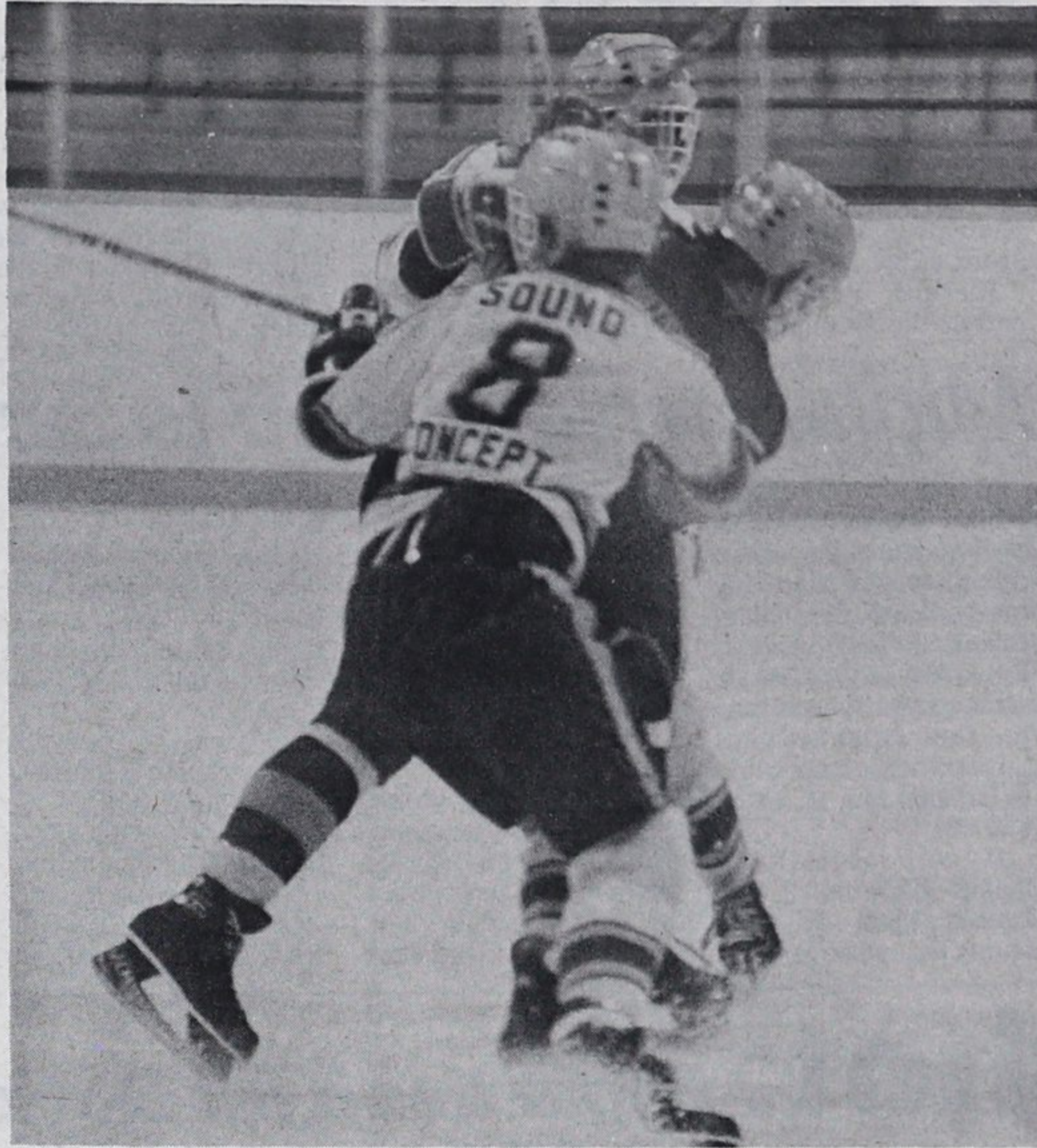
A sandwich fit for a king