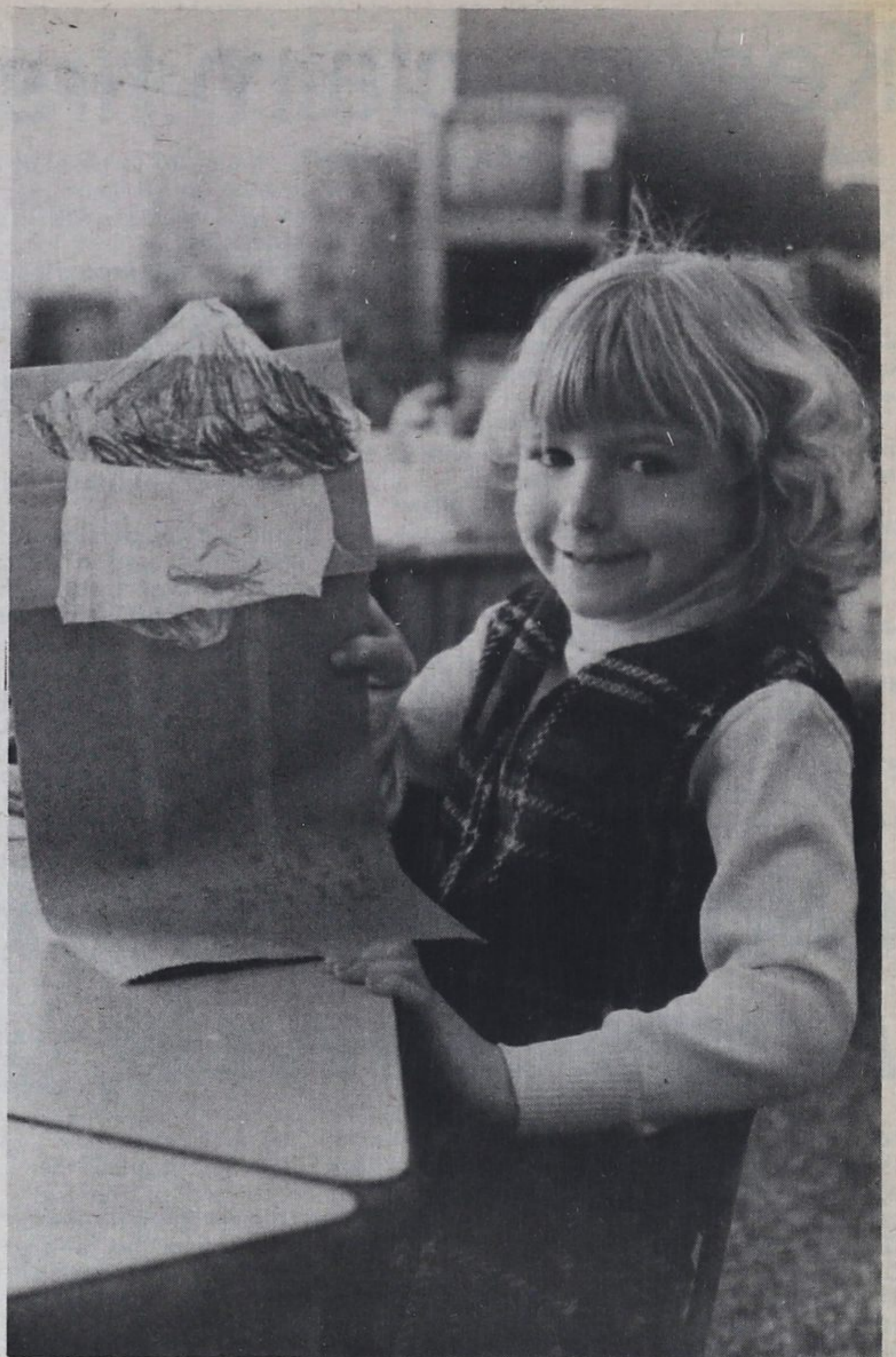
'That's my witch'

The campaign objective is $40,000, which will be used to defray the cost of Y operations in 1981 and thereby allow the Y to serve all segments of our area population by keeping the activity fees as low as possible.