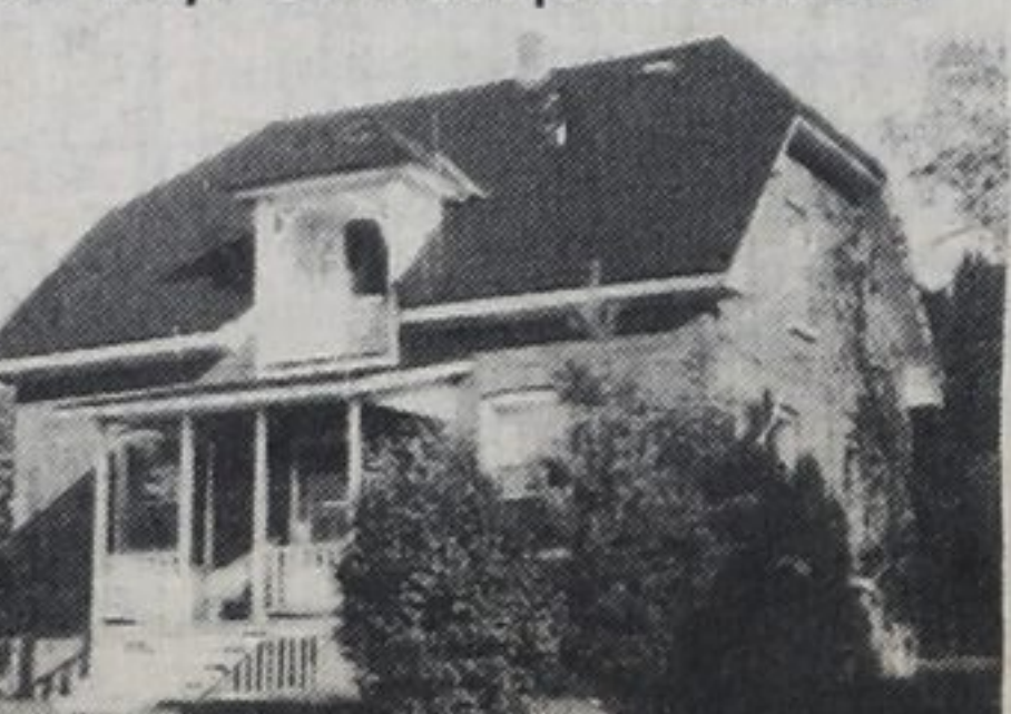
WALKING DISTANCE TO DOWNTOWN SHOPPING! 3 bedrooms, eat-in kitchen, living room with fireplace, asking price $31,900. Full basement. Debbie Cote.