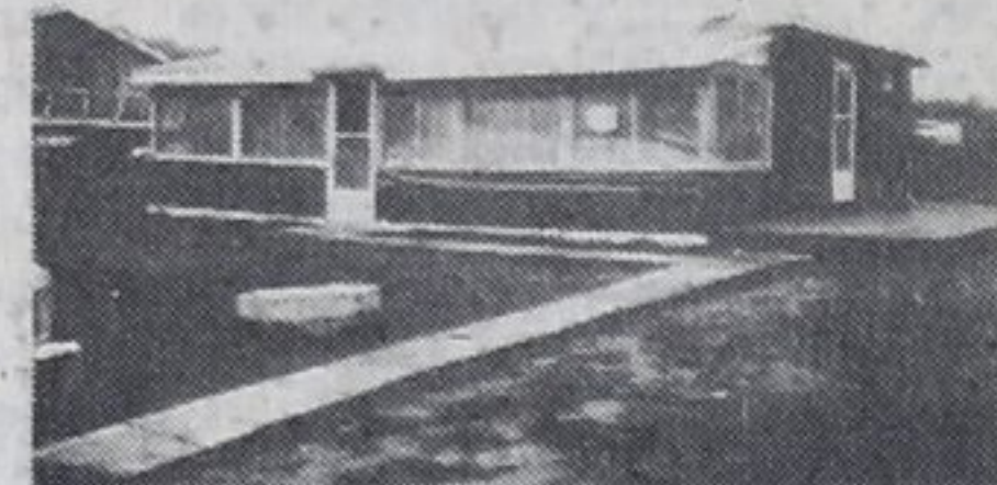
CASWELL'S BEACH ROAD! Reduced by $10,000! Now asking $14,900, for this 2 bedroom bungalow, 115 x 150 ft lot, al-sided, some work is required. Debbie Cote.