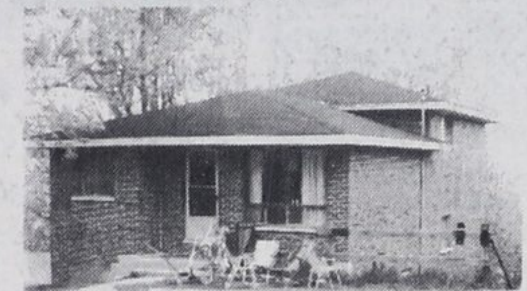
$42,900 - MIDLAND DUPLEX Good mortgage at 11 1/4 per cent, 3 bedroom home, 1 bdrm basement apt, laundry room and storage area. Lots of parking space available. Debbie Cote.