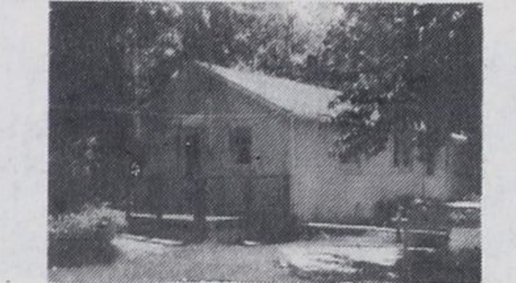
$25,000 - NEAR WAUBAUSHENE 3 bedroom cottage with extra sleeping cabin. 2 minute walk to beach, 100 x 100 ft lot, cedar deck. Vendor will hold mortgage. Frank Wristen.