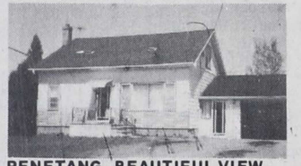
PENETANG - BEAUTIFUL VIEW $41,000 — Eat-in kitchen, large living room, 4 bedrooms, full high basement, laundry room, spacious fenced-in yard. Marjorie Contois.