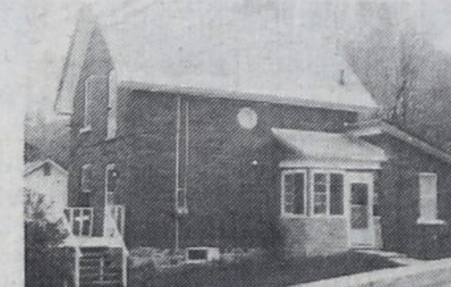
$37,900 - BRICK DUPLEX Vendor will hold the mortgage, 2 bedroom apts, fridge and stove included, 1 bedroom furnished apt. Fully rented apt, are on separate metres. Debbie Cote.