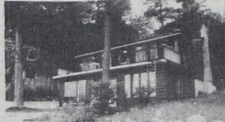
IDEAL WATERFRONT REDUCED $74,900 — 4 bdrms, fully winterized, rec. room with fireplace, heated sun room, large deck, breathtaking view over Geo. Bay. Call Marjorie Contois.