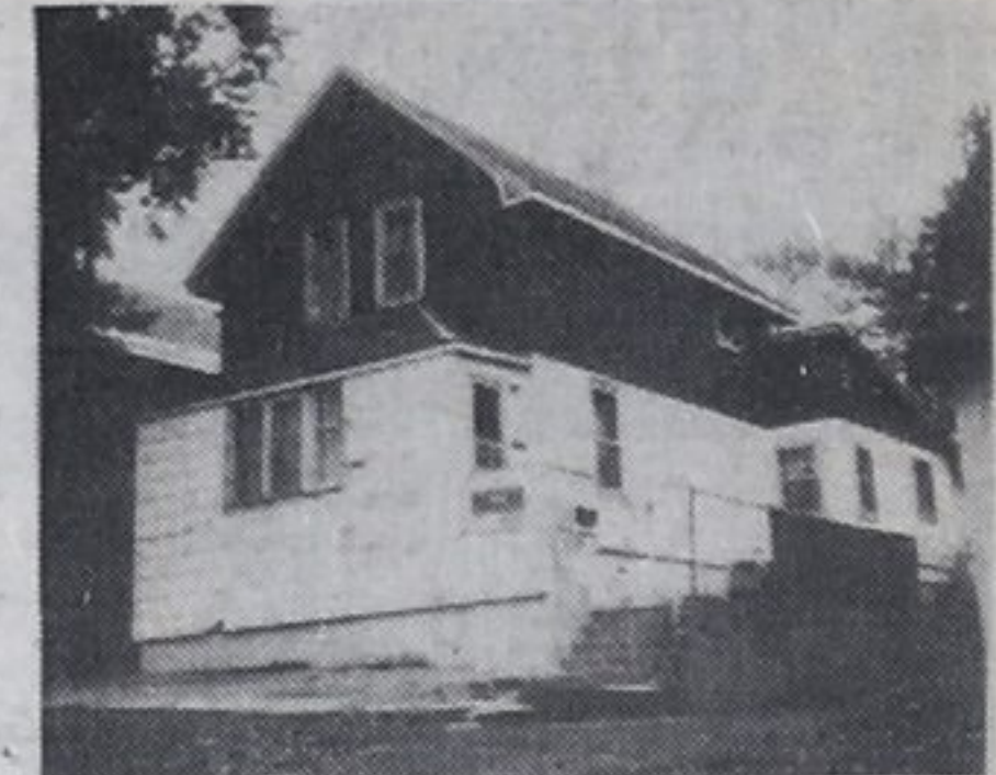
SPACIOUS FAMILY HOME $44,000 — 4 bdrms, large eat-in kitchen, baths, large family room, close to downtown. Marjorie Contois.

$28,900 — 2 bedroom home Fox Street, 200 foot deep lot. Quiet easy to heat home, nice area. Don Tannahill.