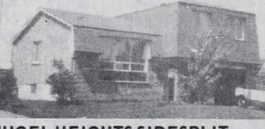
HUGEL HEIGHTS SIDESPLIT $53,900 — Attractively decorated 3 bedrooms, fully broadloomed home, finished rec. room with fireplace, room for family to grow. Frank Wristen.