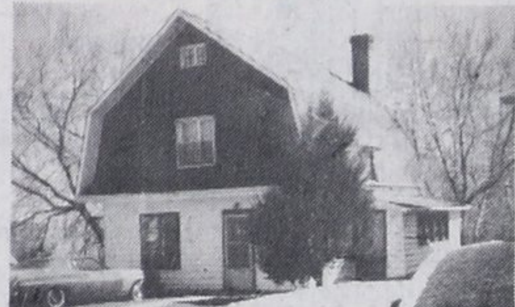
CHARACTER PLUS! $29,900 — 3 bedroom all with closets, lovely 60 x 150 ft lot, full basement with walkout. Debbie Cote.