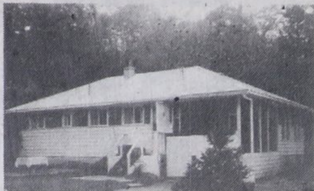
GEORGIAN BAY ESTATES HOME $51,500 — Immaculate inside and out, 2 bdrms, twp water, broadloom, furniture. Audrey Wristen.

A.E. LePage Highway Mall Highway 27, Midland 526-4271 Coldwater 835-3343 Elmvale 322-1381