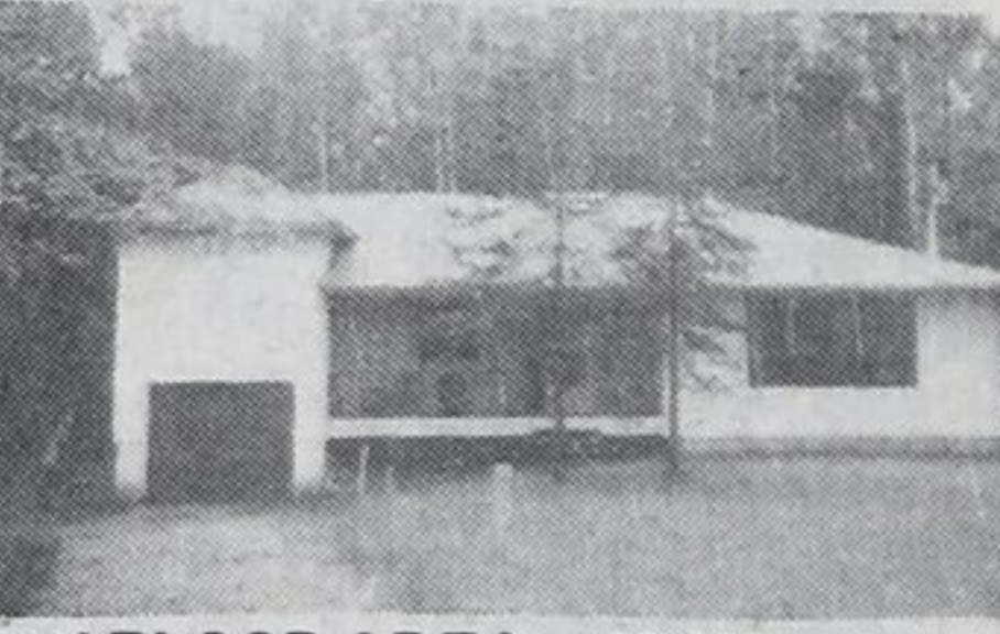
1600' FLOOR AREA - $53,900 In Ardmore Beach. New home on quiet dead-end street. Full basement, natural fireplace, garage, illness in family, forces sale. Clarence Lee.