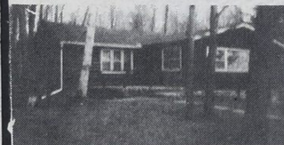
P-48 - Waterfront log cottage. $64,900.