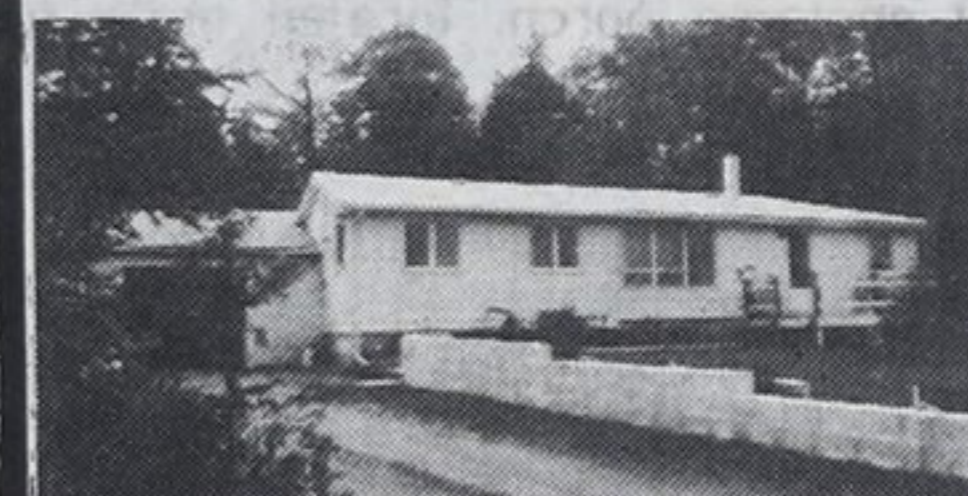
MLS-409 - Just lovely. $45,200.