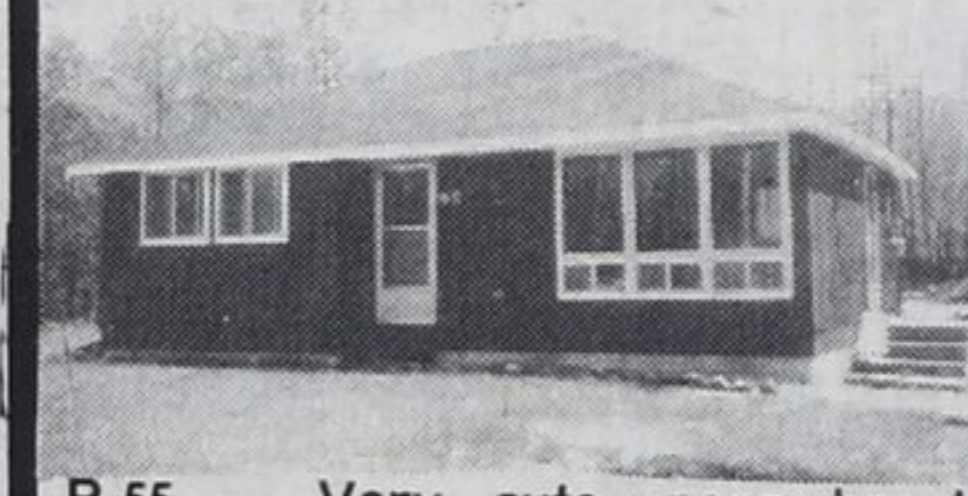
P-55 - Very cute, near beach. $32,500.