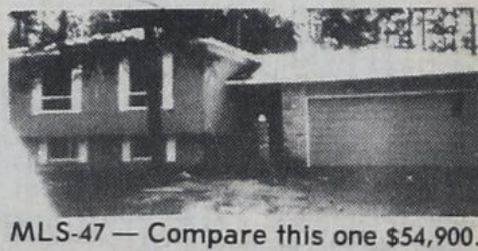
MLS-47 - Compare this one $54,900.