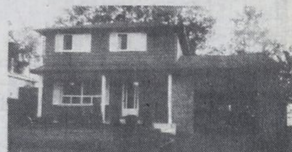
MLS - Woodland Avenue, Midland. $48,900