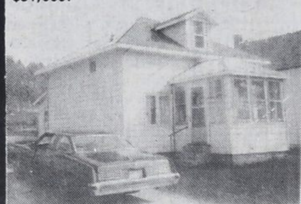
P-53 - Little doll house. $28,900.