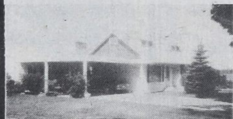
MLS-553 - Wyevale country ranch style bungalow. $62,900.