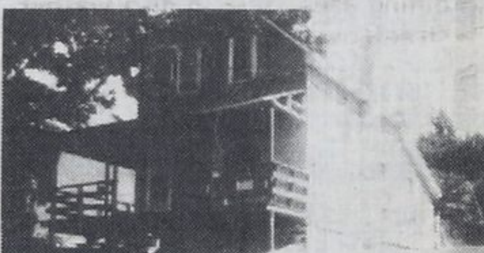
MLS - Penetang view of Bay. $37,900.