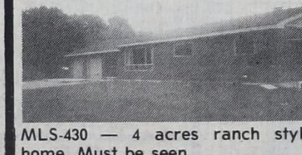
MLS-430 - 4 acres ranch style home. Must be seen.