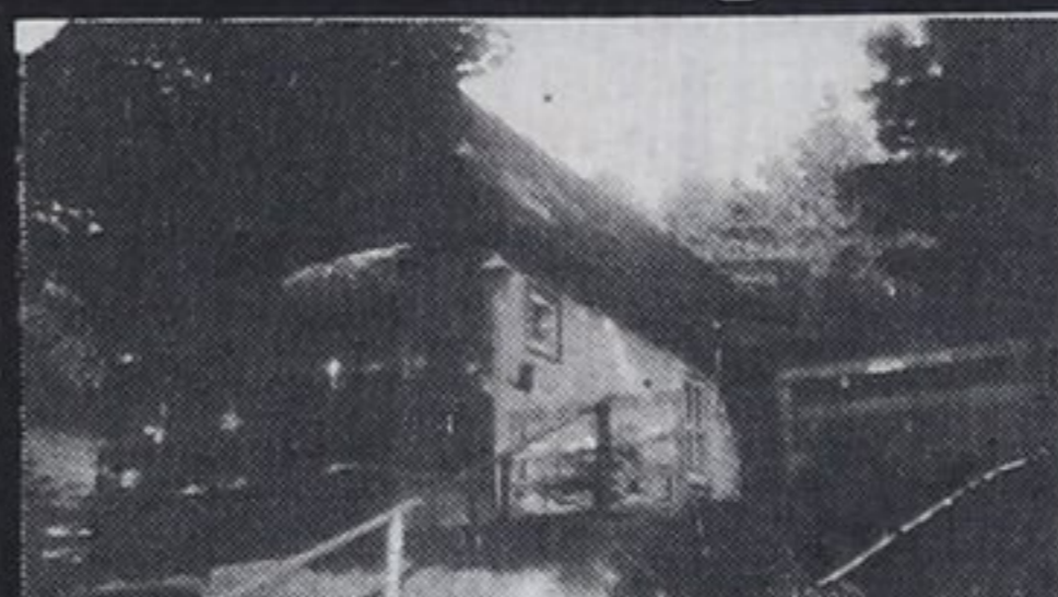
MLS - High and dry. $33,900

PENETANG 549-3104 4. Robert St. W. Penetang & Area