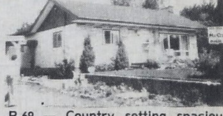
P-69 - Country setting spacious interior. $60,000.