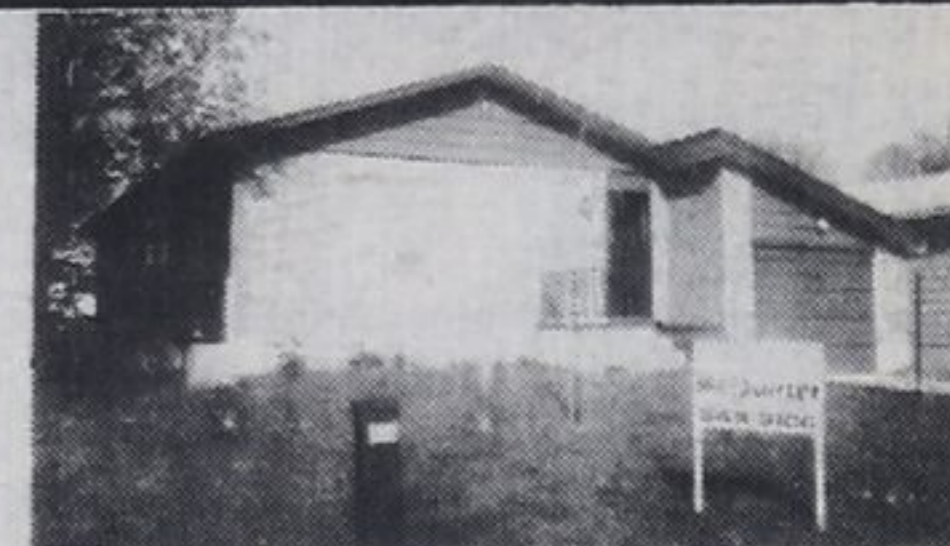
P-52 - Immaculate bungalow. $43,500.