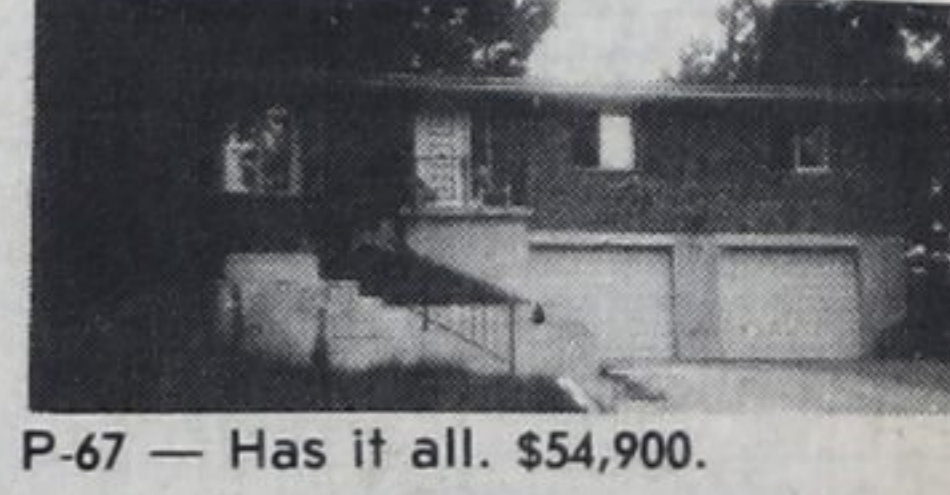
P-67 - Has it all. $54,900.