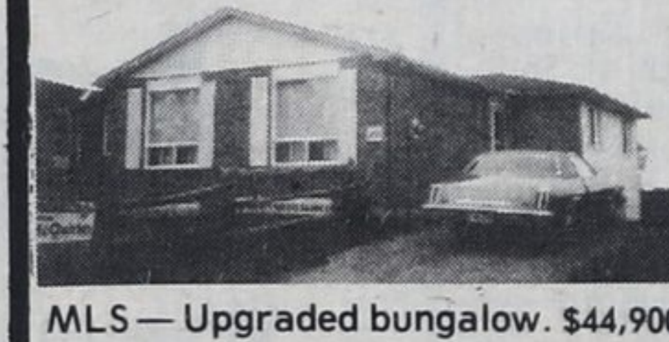
MLS - Upgraded bungalow. $44,900.