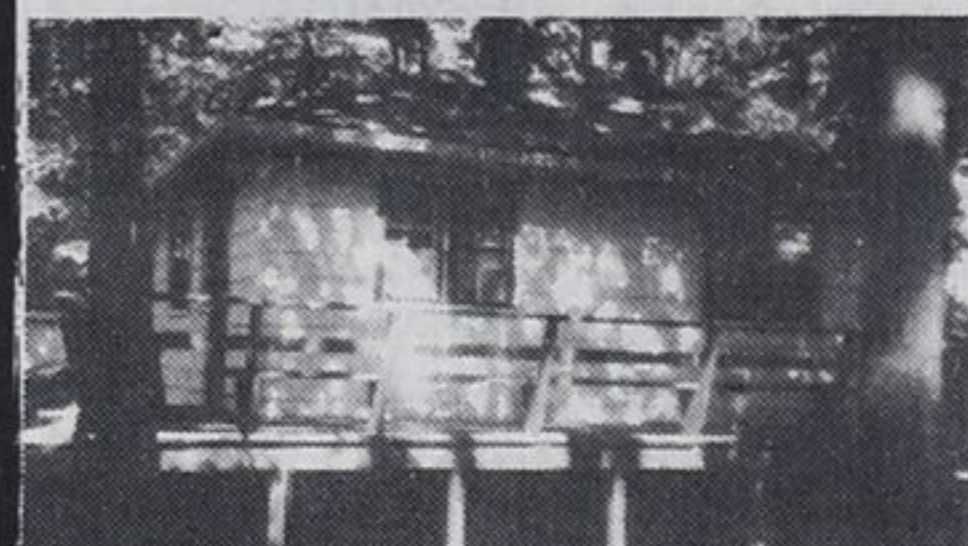
MLS - Ossossane Beach cottage. $31,000.