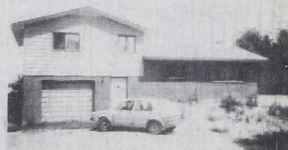
P-68 - 12-acres country with view. $69,900.