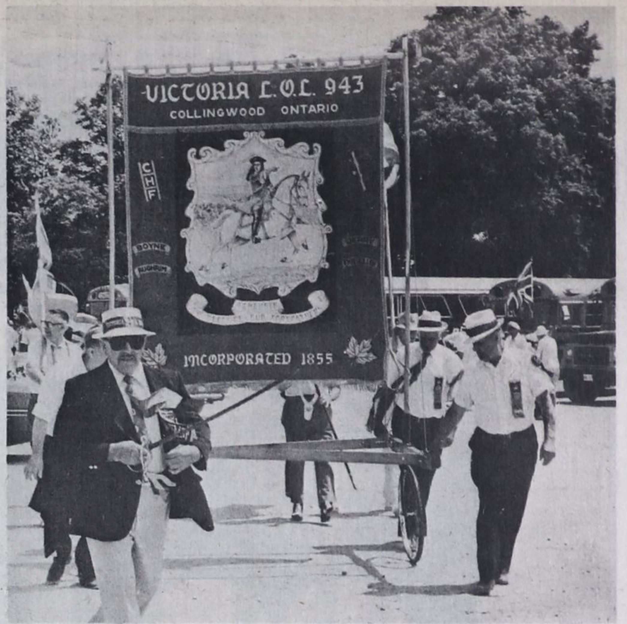
Banner unfurls at Orange parade