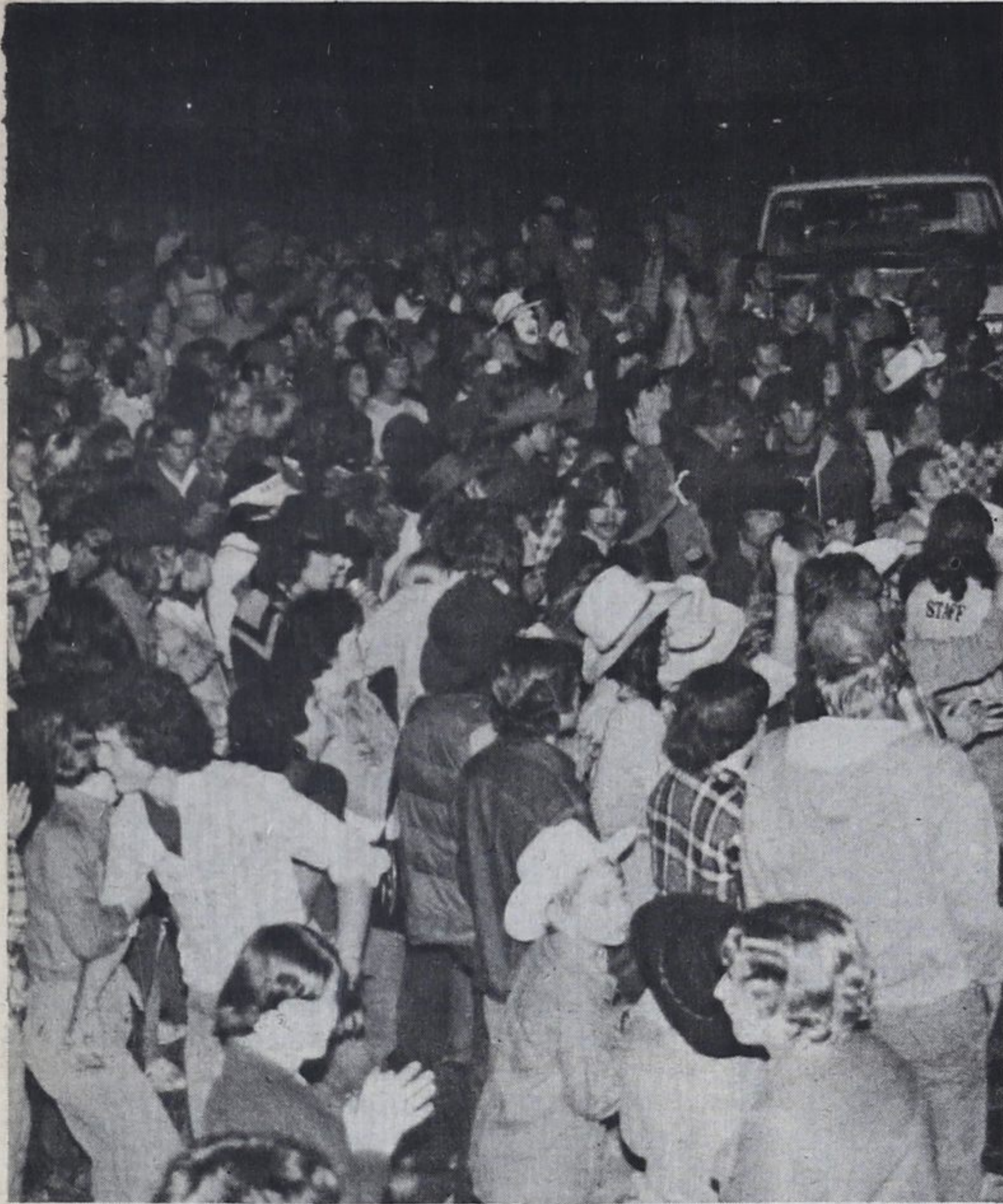
Bluegrass fun near Lafontaine

Once again, the 1980 festival headliners are the very popular Good Brothers. After their 90-minute work out last year, members of the band commented that the Maple Valley festival audience was perhaps the most enthusiastic they had ever played for. The Good Brothers are scheduled