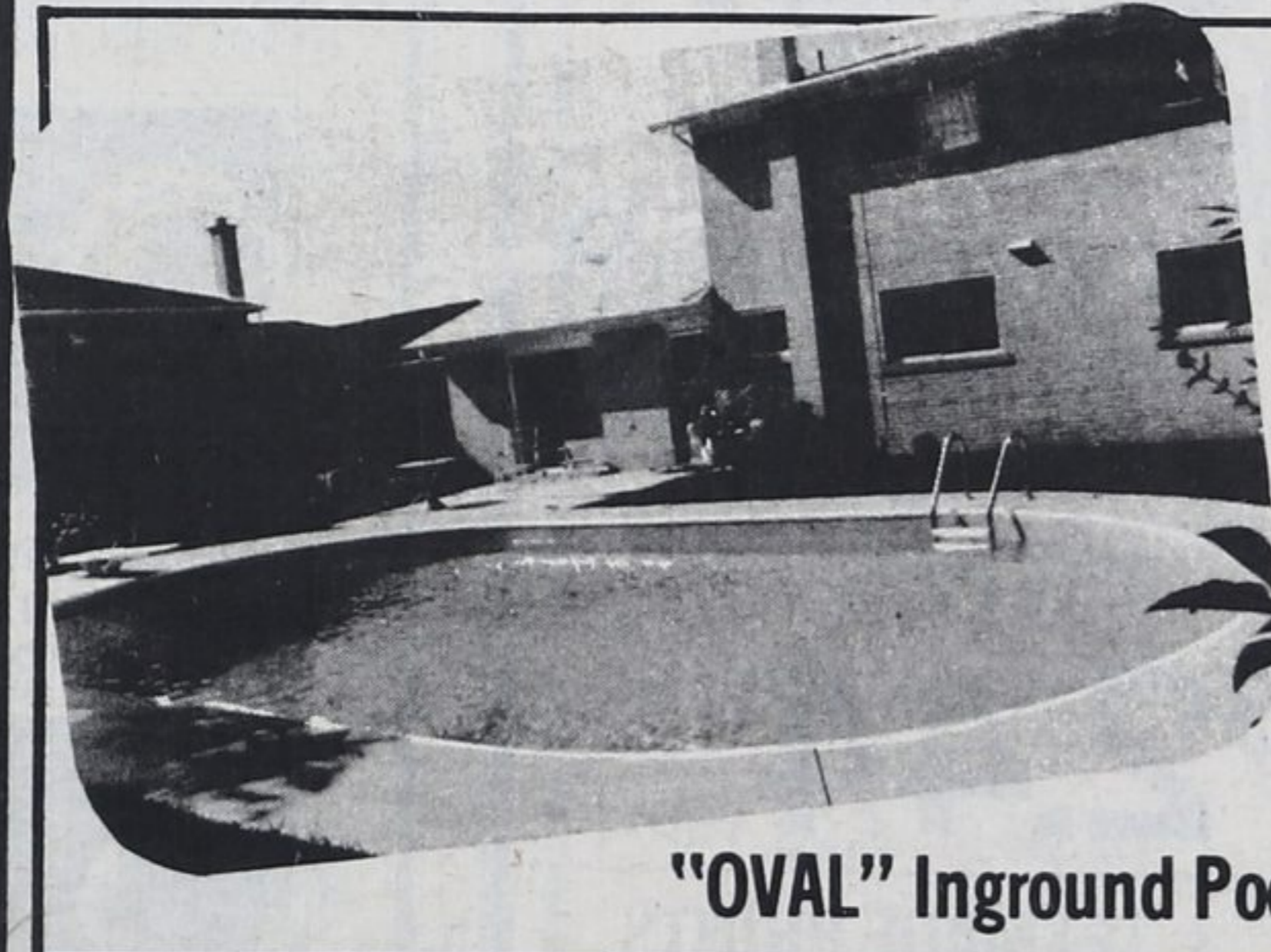
"OVAL" Inground Pool