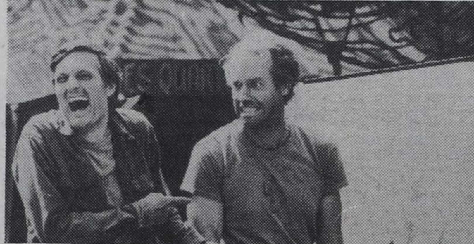
MILITARY MADCAPS—Alan Alda (left) and Mike Farrell try to keep face amidst the lunacy of the Korean War in the phenomenally successful CBC comedy series "M*A*S*H."

1 NEEDS 2 MUPPER 3 DENVER 4 ERA 5 STOOGE 6 EEBAS 7 UNNT 8 TRIKE 9 CARON 10 AVARE 11 MT NAPAF 12 EL STORIES 13 NAW NOBLE 14 URANUS 15 FRAMER 16 CHILD 17 JULIA