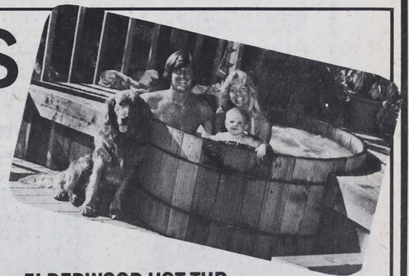
5' REDWOOD HOT TUB