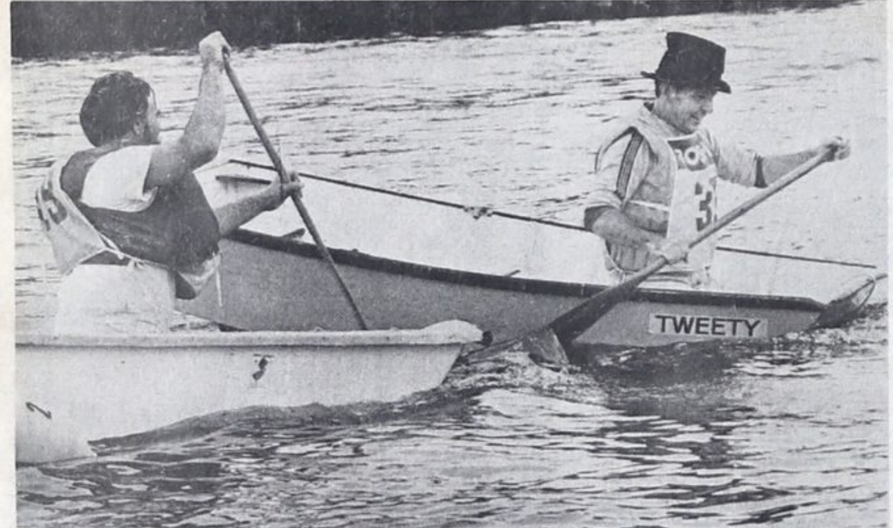
The battle begins

The famous Battle of Trafalgar could hardly compare with the Battle of Midland Bay which occurred during the Great Small