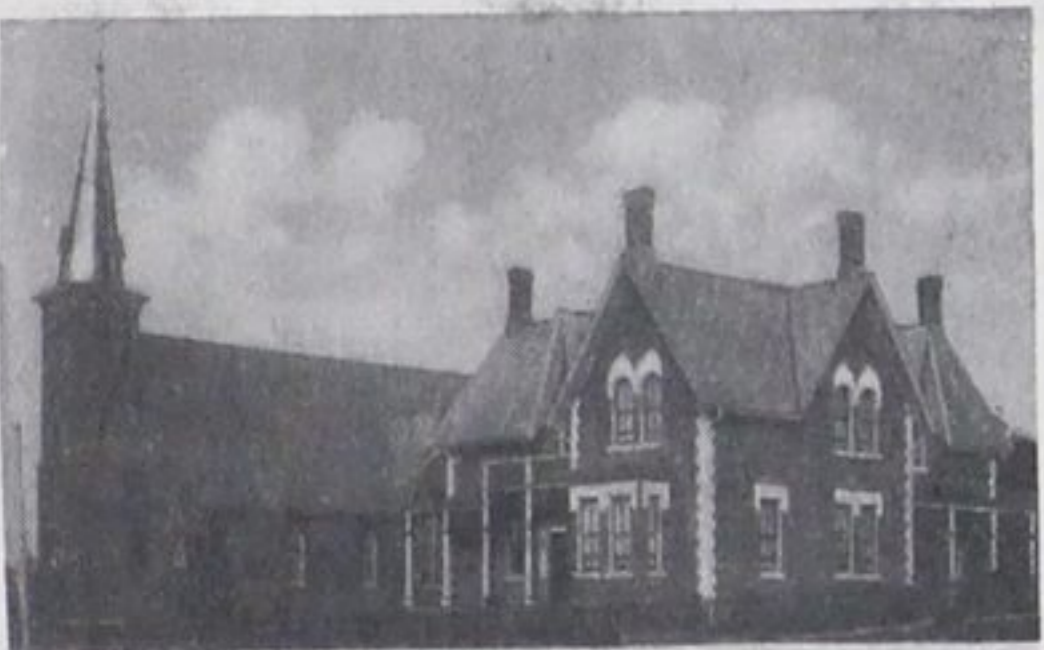
Old Catholic Church.

Save these for your Centennial Scrapbook or see if you can indentify the people in the pictures.