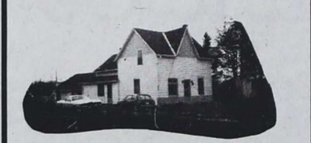
This is a large home with five bedrooms, and over 25,000 sq. ft. of property right in Elmvalle. Asking $47,000. 7-26.