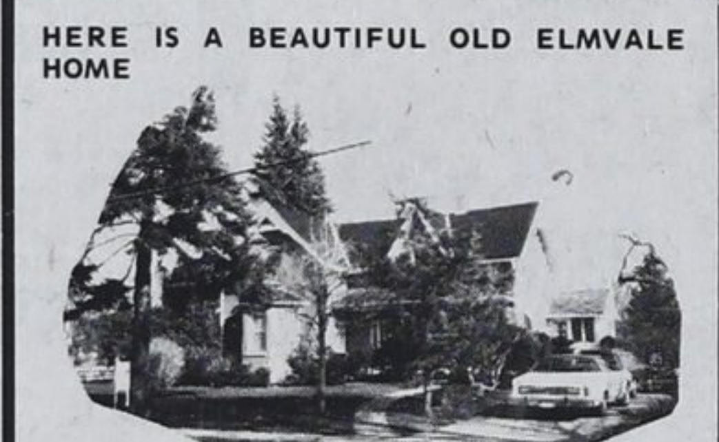
100 years solid! 12 rooms, 1 1/2 baths, in lovely condition. Shown by appointment. 7-54.