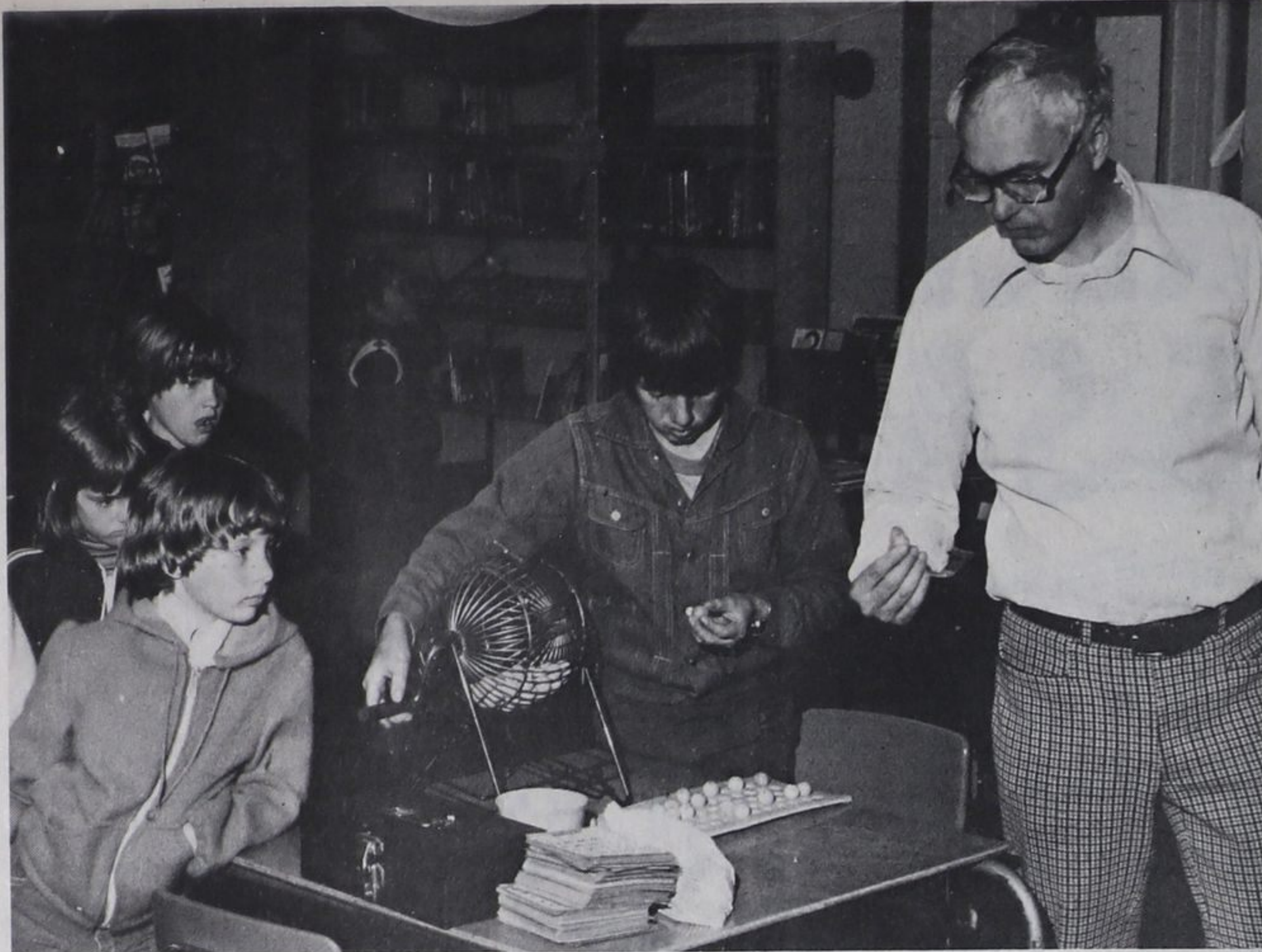
Fun Fair Regent Street public school announced fun fair last weekend. Among the activities was this bingo game, other games of chance and many displays.