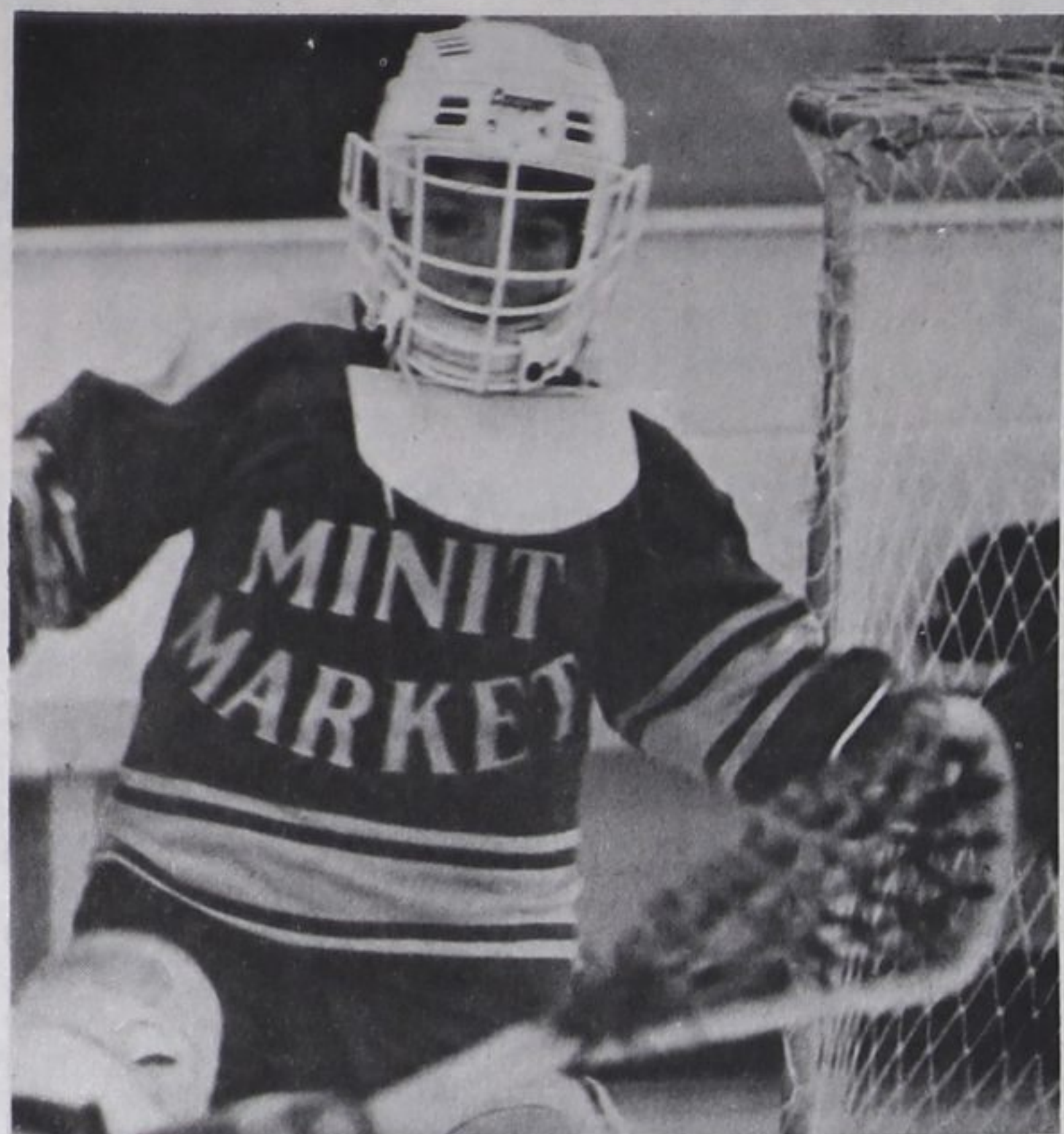
Here they come again