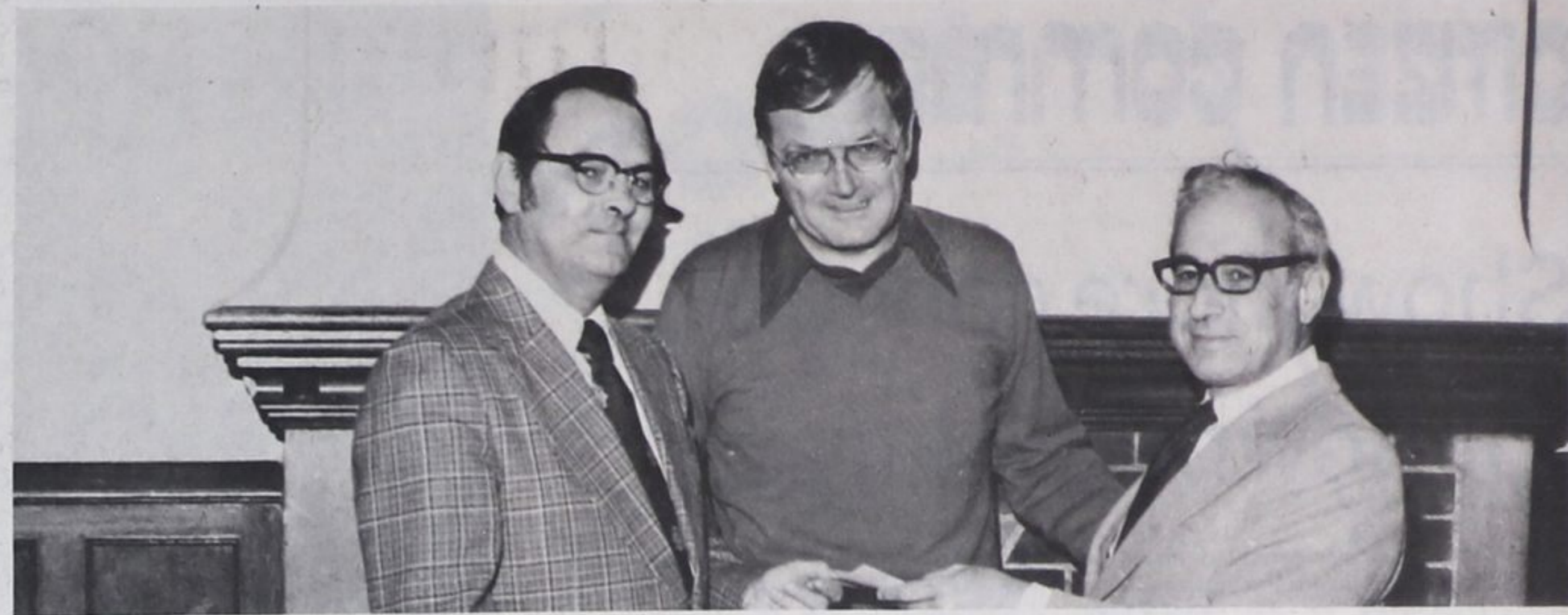
Shot in the arm

There are 20 things on the program which will be interrupted with a short intermission for refreshments in the lobby.