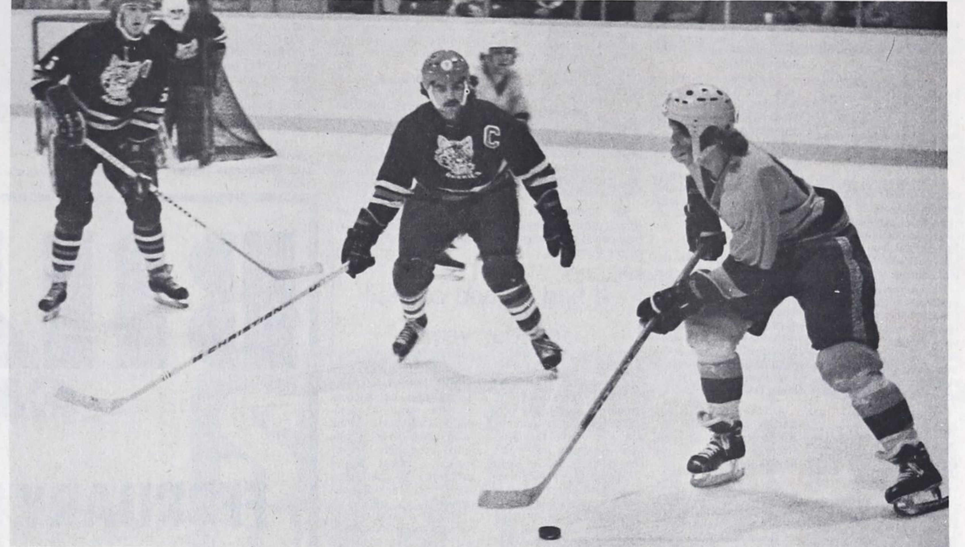
Tried in vain

Kings will try to snap out of their losing a streak against the same Bracebridge Bears tonight at the Penetanguishene Arena. Game time is 8:30 p.m.