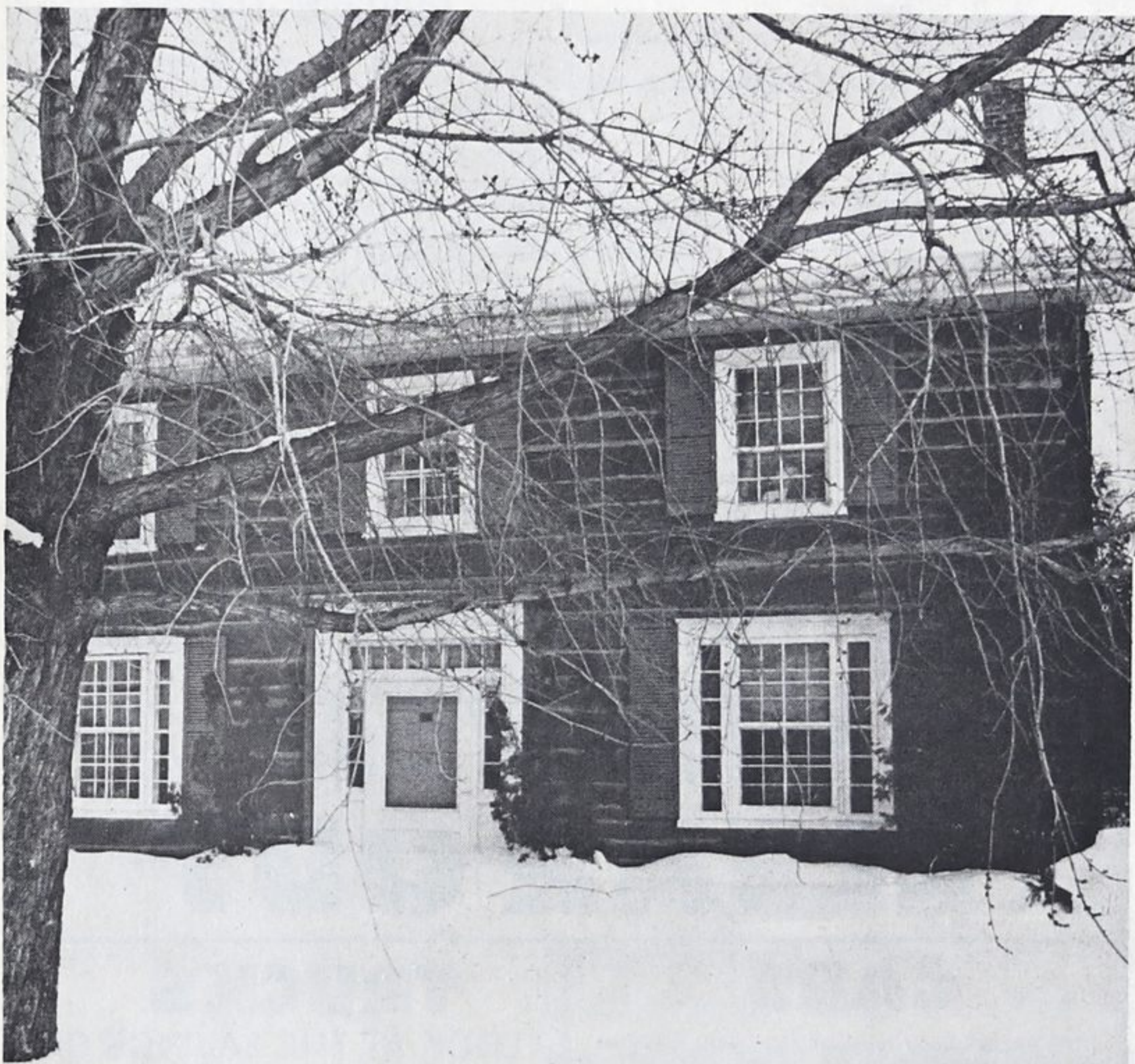
White pine walls