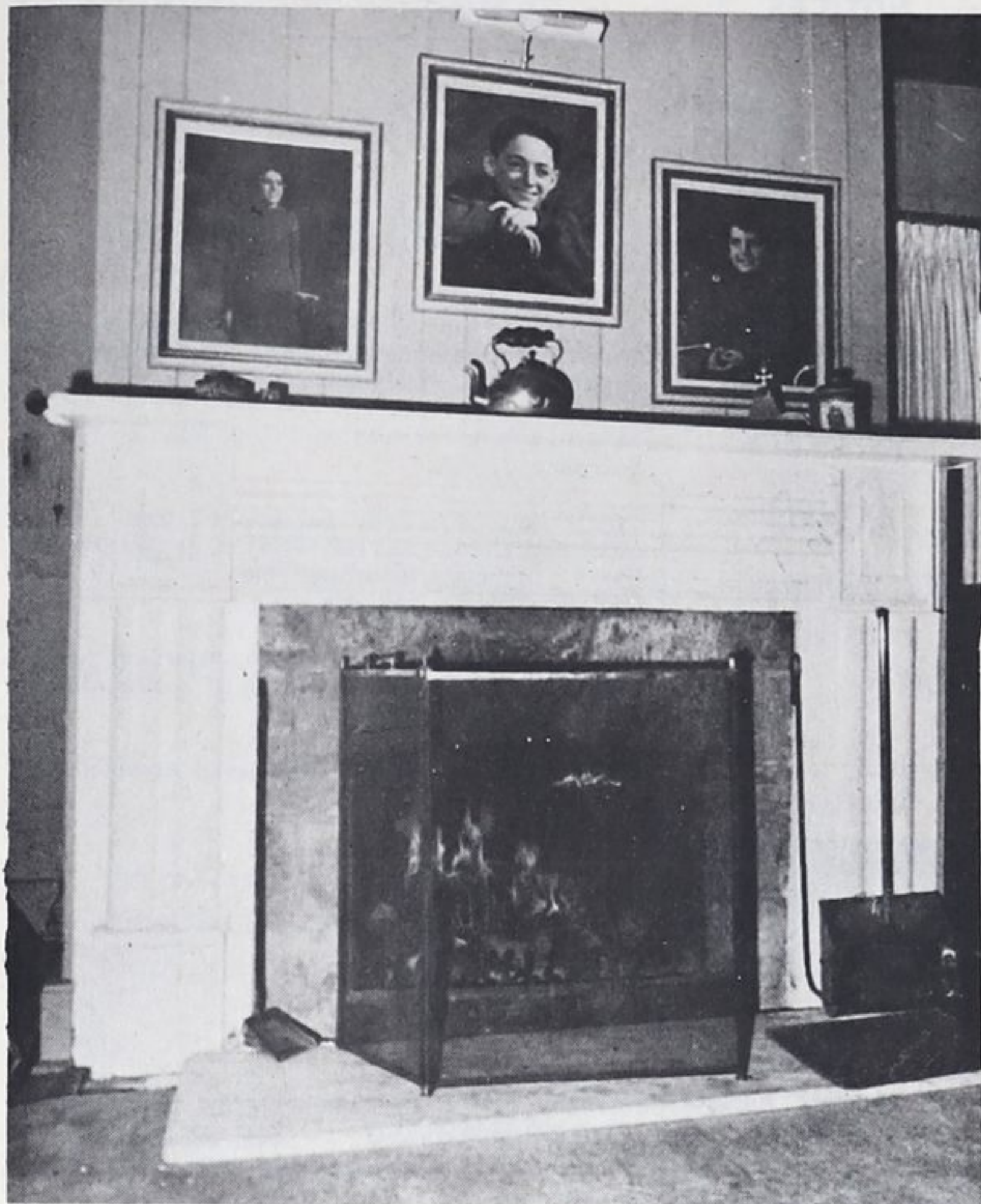
Can heat the house