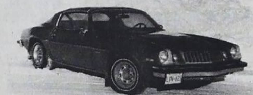
1977 CAMARO, 2 dr. sport coupe, with 305 V8, auto. trans., p.s., p.b., radio, rear speaker, rally wheels, radial w.w. tires, bucket seats, console. Hatch roof. Only 14,000 miles. Lic. LVN 623.