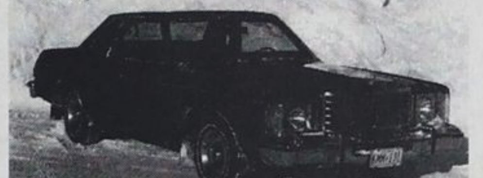
1976 FORD GRANADA, 2 dr. coupe, with 302 V8, auto. trans., p.s., p.b., step bumper, electric rear defroster. Radial w.w. tires, wheel discs, only 17,000 miles. Lic. KMM 131.