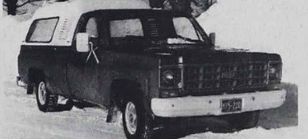
1977 CHEVROLET 1/2 ton pick-up, with 305 V8, auto. trans., p.s., p.b., step bumper, West coast mirrors, h.d. rear springs. Low mileage. Lic. H 75220.