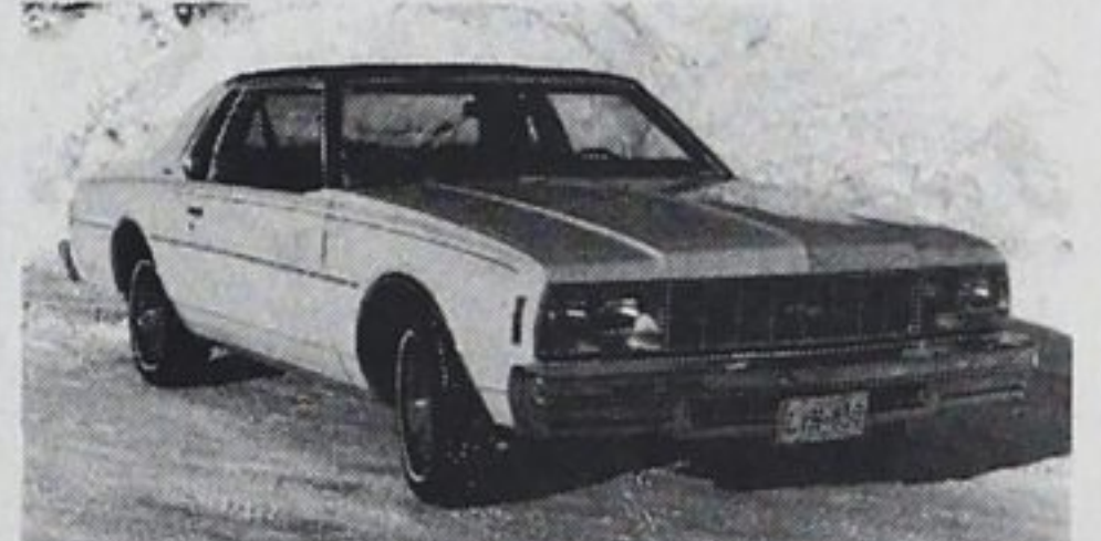
1977 CHEVROLET IMPALA, 2 dr. coupe with 305 V8, auto., p.s., p.b., electric rear defroster, w.w. radials, vinyl roof, radio, etc. Low mileage. Lic. LVN 830.

With all the snow we've had, we've finally dug these beauties up and we're lowering the prices on them so we can move them out before they get buried again.