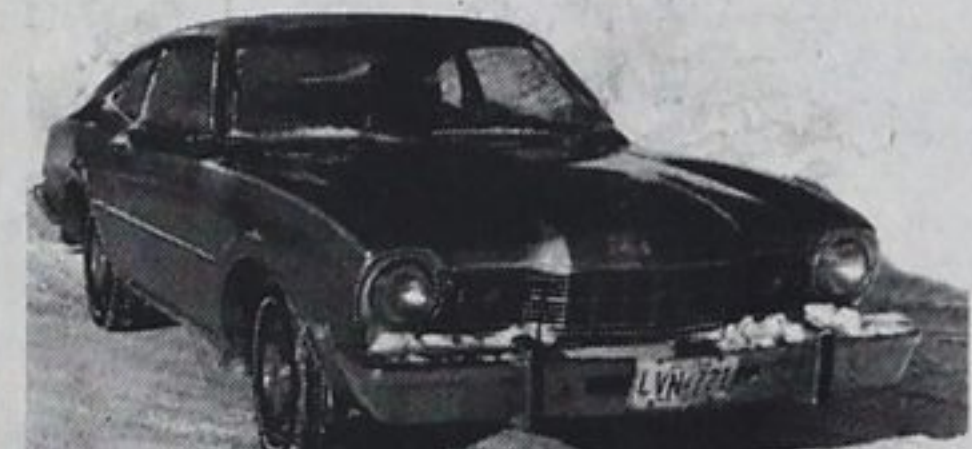
1974 MERCURY COMET, 2 dr. coupe, with 250 cu. in. 6 cyl., auto. trans., p.s., radio, rear defroster, Michelin radial w.w. tires, wheel discs. A little beauty, only 43,000 miles. Lic. LVN 721.