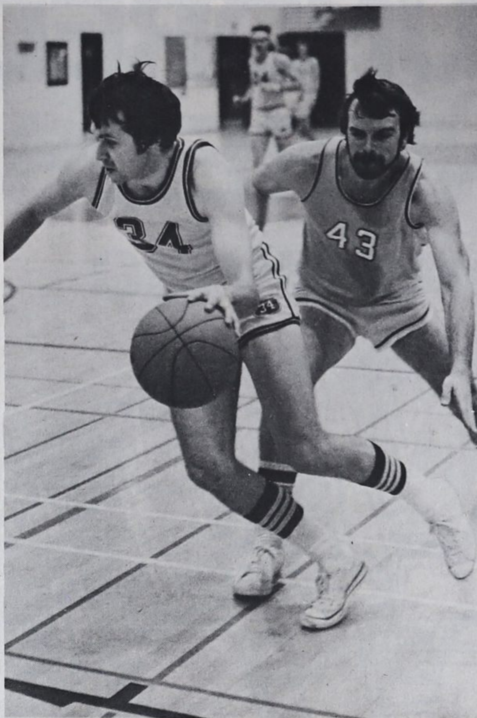
Gives him the slip